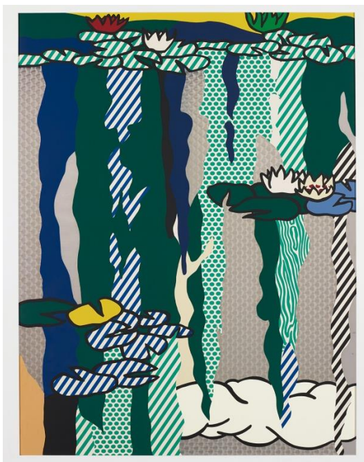
ROY LICHTENSTEIN Water Lilies with Cloud, from Water Lilies Series, 1992 Estimate $200,000 - 300,000

Jasper Johns , Untitled (back cover) from a group of 8 proofs in various experimentations of primary and secondary colors. Richly colored and impeccably printed in monumental scale, this print is truly an achievement of experimentation and innovation. Closely related to his painting Land's End (1963) which was used as a starting point and revisiting and exploring further through his prints, this particular example reveals the artists thinking and working process in clarity. All numbers '1/2' are in the National Gallery of Art, Washington D.C. collection, the one being offered here is from an important and prestigious American Collection.