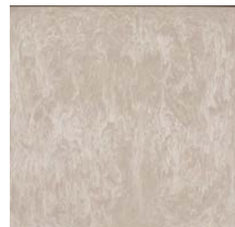
STERLING RUBY Alabaster SR10-2, 2010 Estimate $100,000 - 150,000