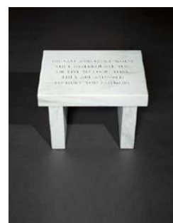
JENNY HOLZER Die Fast and Quiet... (from The Survival Series), 1983-85 Estimate $50,000 - 70,000