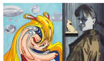
DAVID SALLE Painting for HCA, 2007 Estimate $60,000 - 80,000