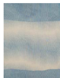
HUGH SCOTT-DOUGLAS Untitled 032, 2011 Estimate $20,000 - 30,000