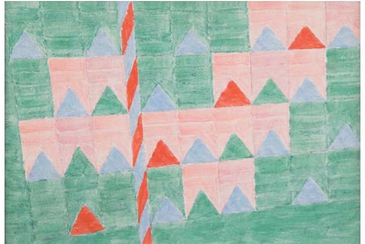
Alfredo Volpi Banderinhas com maestro , circa 1970 Estimate: $100,000-150,000