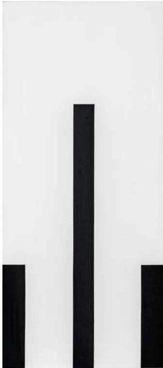
Carmen Herrera Untitled, 1971