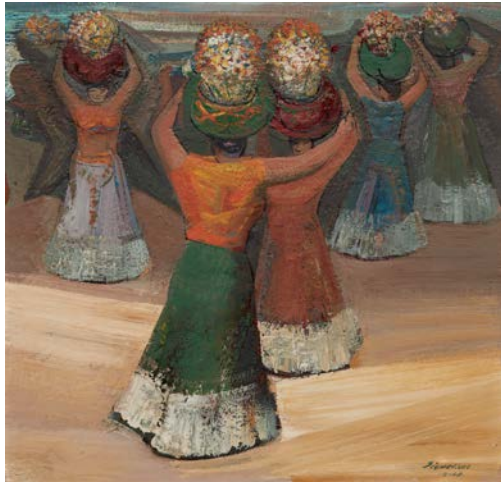
David Alfaro Siqueiros Tehuanas , 1949 Estimate: $250,000-350,000