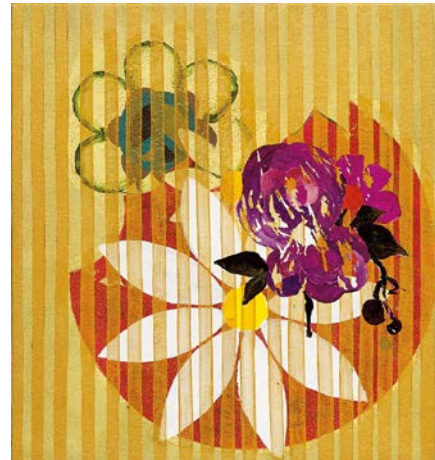
Beatriz Milhazes O Cisne , 2001 Estimate: $200,000-300,000