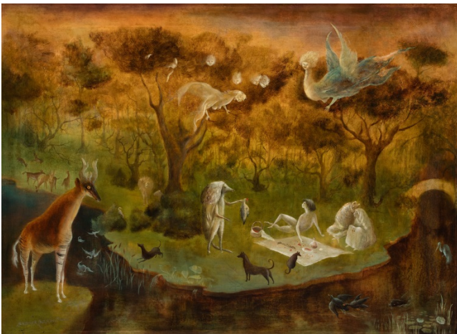
Leonora Carrington Pastoral , 1950 Estimate: $500,000-700,000

countless museum exhibitions around the world, including a major retrospective at the Solomon R. Guggenheim Museum in New York in 1979.