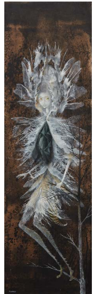
Remedios Varo La Mujer libélula (Dragonfly Woman) , circa 1961 Estimate: $300,000-500,000

Like Carrington, Remedios Varo left war-torn Europe for Mexico, where she was freed from the binds of the male-dominated Surrealist canon and able to express herself more freely in her art. Her jewel of a painting, La Mujer libélula (Dragonfly Woman) (illustrated right), will also be offered in the auction on 24 May. For Varo, Mexico was an ideal setting, as it gave her the physical and metaphorical distance from French Surrealism that allowed her to concretize a new form of the European movement, exploring the female psyche and portraying women as protagonists rather than the typical male-centric vision of her counterparts in Europe. La Mujer libélula (Dragonfly Woman) is a key example of this effort,