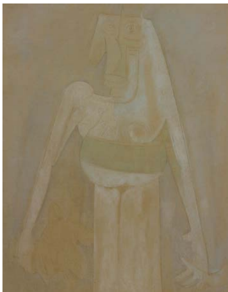
Wifredo Lam Untitled, circa 1943 Estimate: $300,000-500,000

An untitled work by Wifredo Lam, executed circa 1943 (illustrated left), is another highlight of the sale. Among Lam's many contributions to modern painting, he expanded both the parameters of Surrealism and Cubism by imbuing his work with a unique Afro-Cuban vocabulary infused with Santería. The subtle luminosity of the painting illustrated here embodies one of Lam's iconic motifs, the metamorphosed figure of the femme-cheval – a hybrid creature, both woman and horse – possessed by a spiritual divinity. When Lam painted Untitled , he was at the height of his career, producing some of his most important works, including his masterpiece, The Jungle , 1943, purchased by the Museum of Modern Art, New York, the year of its creation. Internationally lauded during his lifetime, Lam's importance has recently been re-acknowledged with retrospectives at the Centre Pompidou, Museo Reina Sofia, and the Tate Modern in 2015 and 2016.