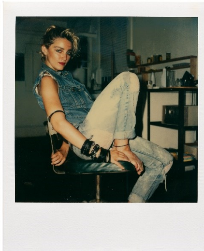
Richard Corman Madonna, June 17, 1983 Estimate: $60,000 - 80,000 2 of 66 Polaroids illustrated