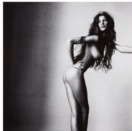
Irving Penn Gisele, New York, April 1, 1999 Estimate: $70,000 - 90,000

Works from several private collections will also be offered in the April auction, including fifteen lots from an important Private European Collection, which celebrate icons of beauty from the 20th century and the master photographers who captured their timelessness. From Herb Ritts' seductive Cindy Crawford and Irving Penn's statuesque Gisele, which leads the group (illustrated right), to Terry O'Neill's windblown Brigitte Bardot and Eve Arnold's enigmatic Marilyn Monroe, these