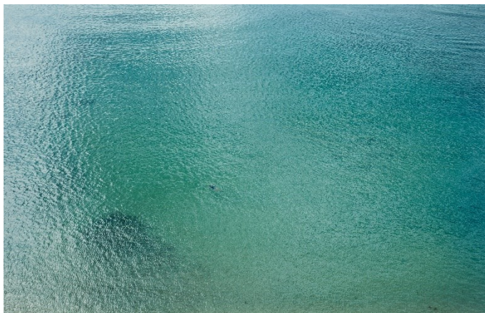
Richard Misrach Untitled #833-02, 2002 Estimate: $50,000-70,000