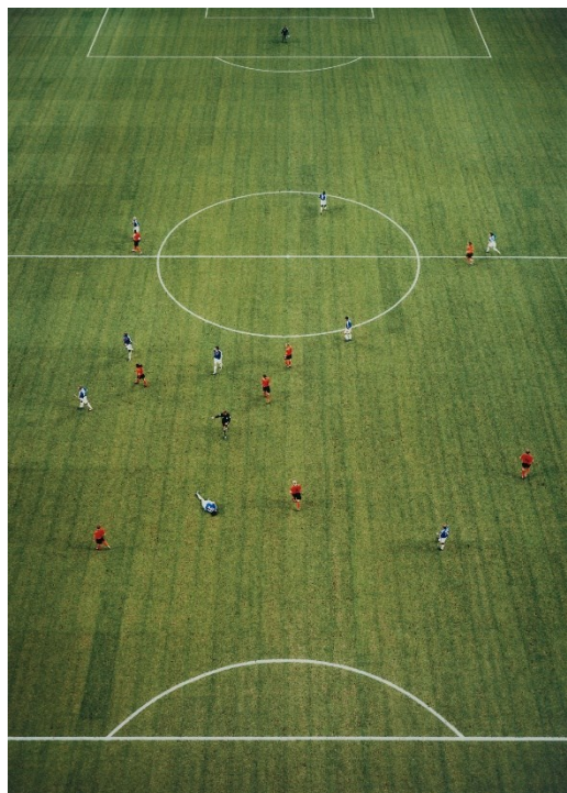
Andreas Gursky EM, Arena, Amsterdam I , 2000 Estimate: $350,000-450,000

Leading the auction on 9 April is Peter Beard's Heart Attack City (illustrated page 1). While Beard's photographic documentation of African wildlife is responsible for his early reputation, it is his collages that are among the most significant works in his oeuvre and that link him to artists like Robert Rauschenberg and Joseph Cornell. This large and brilliantly complex work combines Beard's deep interest in the natural world and his fascination with beauty. The juxtaposition of Marilyn Monroe with Beard's aerial photographs of the elephant carcasses in Kenya's Tsavo National Park eloquently draws these themes together within an impressive and visually dazzling composition. Beard's handwritten script appears around the entire periphery of the central images and includes daily memoranda, and statistics and history on the elephant deaths at Tsavo. Drawings by the Hog Ranch Art Department – African artists who often embellish his work – add layers of meaning and provide an injection of bright color as they fill the margins of this impressive work.