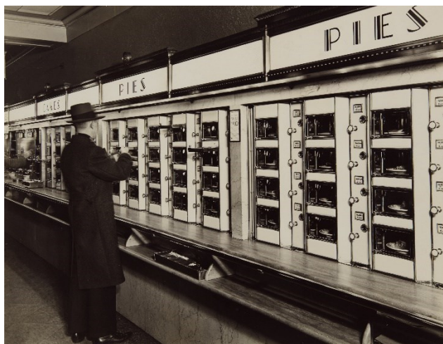
Berenice Abbott Automat, 977 Eighth Avenue, 1936 Estimate: $20,000 - 30,000

subjects defined the cultural zeitgeists of their respective eras. Each image commands its own space with a strong impression of the elegant, playful, peaceful, or at times somber subject.