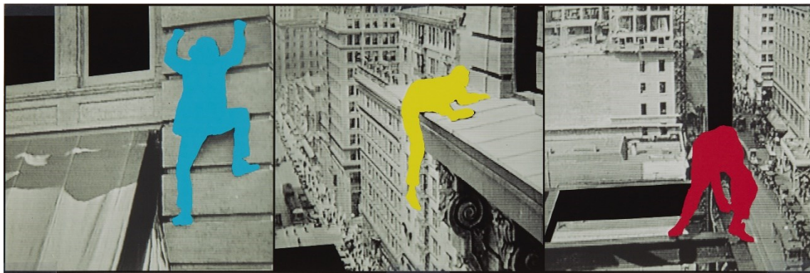
John Baldessari Duress Series: Person Climbing Exterior Wall of Tall Building/Person on Ledge of Tall Building/Person on Girders of Unfinished Tall Building (Maquette), 2003 Estimate: $40,000-60,000

Auction: Monday, 9 April 2018 | 10am & 2pm EDT