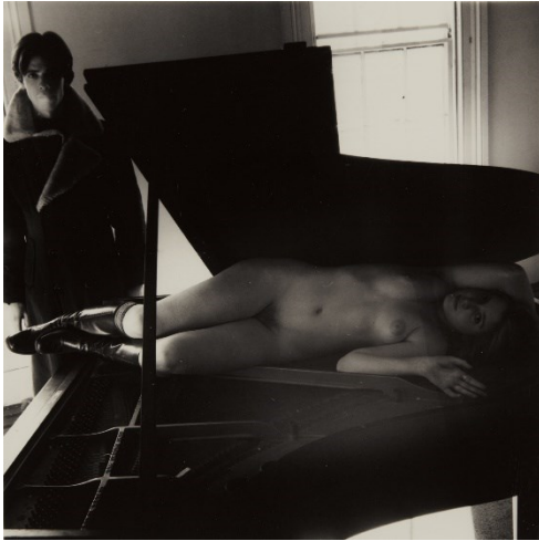
Francesca Woodman Untitled, Providence, RI, 1975-1978 Estimate: $30,000-50,000