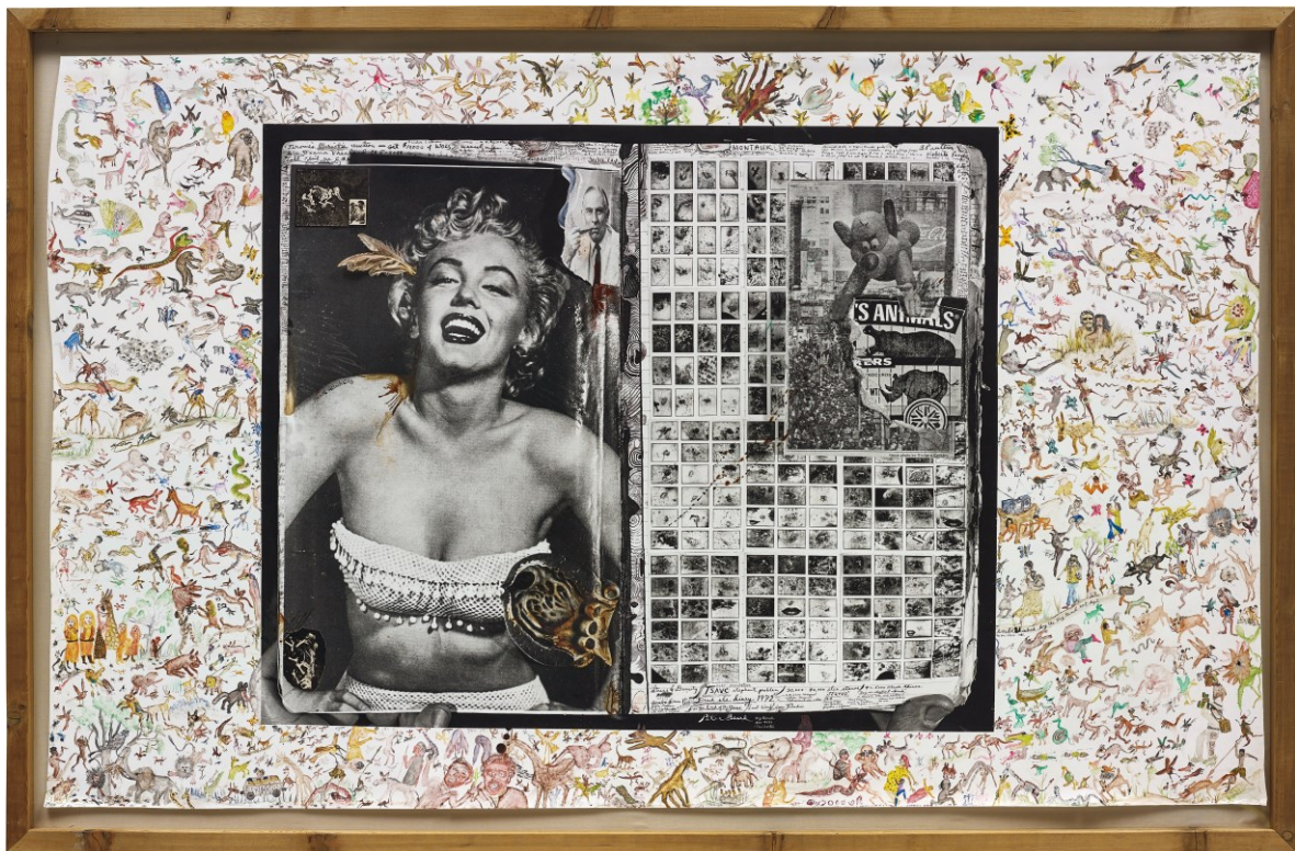
Peter Beard Heart Attack City, 1972 Estimate: $500,000-700,000

Sale on 9 April to Feature Masters of Photography, including Edward Steichen, Andreas Gursky, Richard Misrach, and John Baldessari