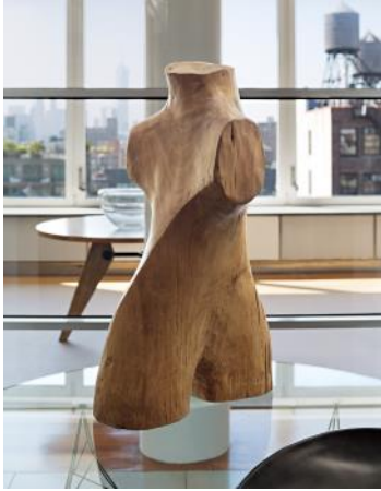
Alexandre Noll , Exceptional torso sculpture , 1950s Estimate: $100,000-150,000