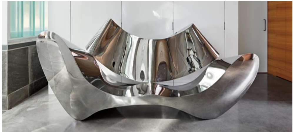
Ron Arad , "D-Sofa" , 1994 Estimate: $100,000-150,000