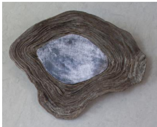
Line Vautrin Unique "Huître" mirror , circa 1958 Estimate: $80,000-120,000