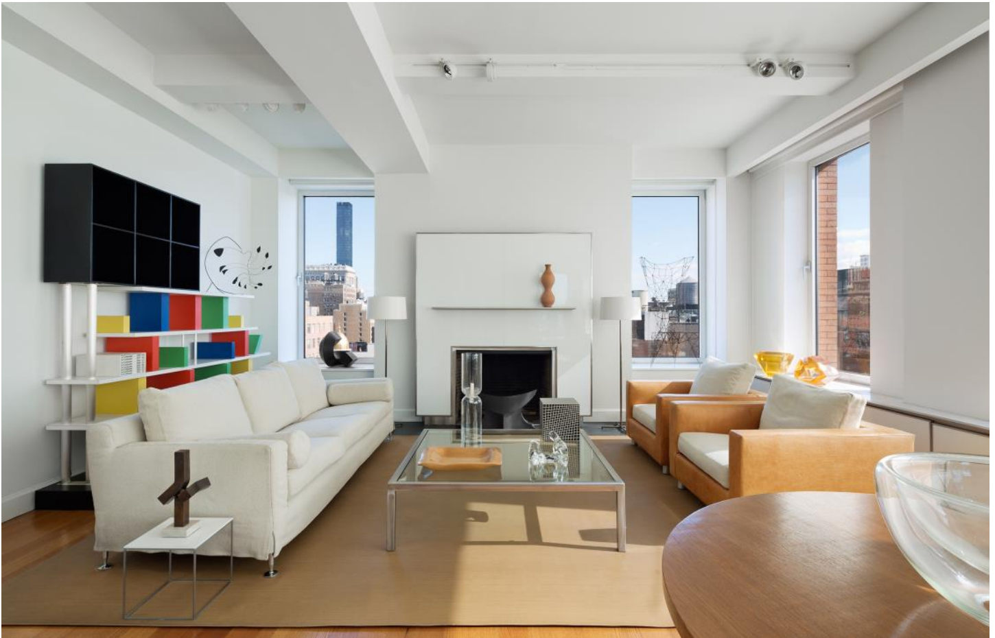
Living Room at Mindel Residence

Auction to be Held in New York on 13 December