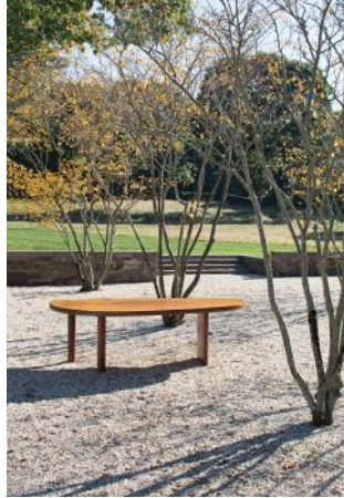
Charlotte Perriand , Free-form dining table , model no. 242 , circa 1959 Estimate: $100,000-150,000