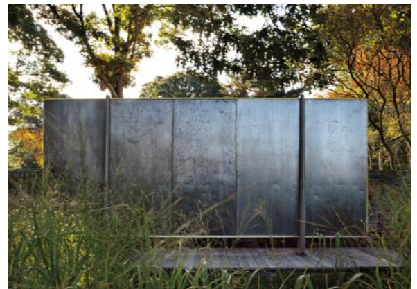
Jean Prouvé Room divider/screen , circa 1959 Estimate: $70,000-90,000