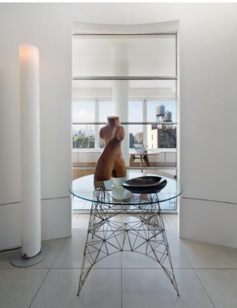
Alexandre Noll , Exceptional torso sculpture ,