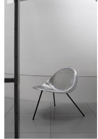
Poul Kjærholm , Rare Molded Aluminum Chair , 1953 Estimate: $80,000-120,000