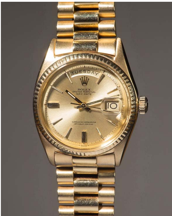
Jack Nicklaus' Yellow Gold Day-Date Ref. 1803