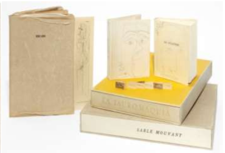
PABLO PICASSO La Célestine , 1971 ESTIMATE $80,000 - 120,000 Escrito/Pismo , 1948 ESTIMATE $20,000 - 30,000 Température , 1960 ESTIMATE $6,000 - 8,000 La Tauromaquia , 1959 ESTIMATE $30,000 - 40,000 Sable mouvant , 1966 ESTIMATE $10,000 - 15,000