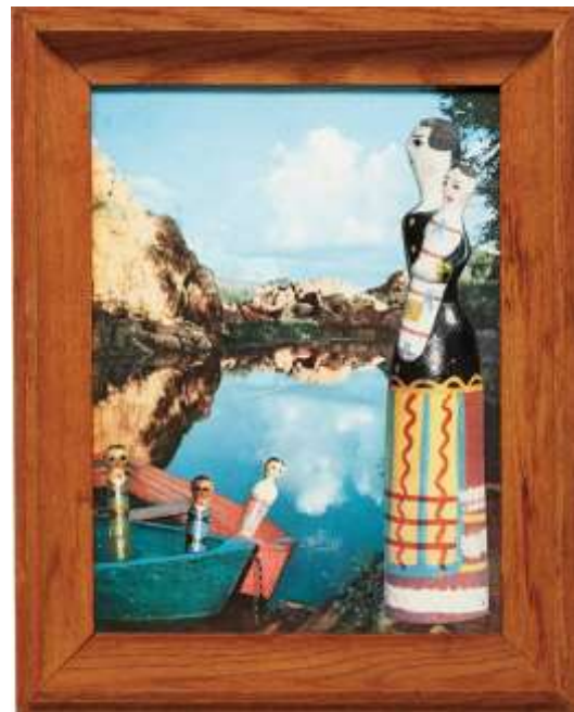
JOSEPH CORNELL Julie Spinasse , circa 1950-60 ESTIMATE $12,000 - 18,000