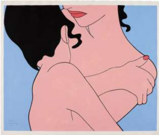
JOHN WESLEY Tears? , 1993 ESTIMATE $30,000 - 50,000