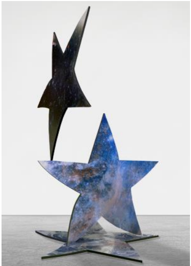
Andrew Levitas #Godselfie, 2014

Developed by the artist, Metalwork Photography® is a patented process involving the transfer of photographs onto custom transparencies that are in turn melted onto hand etched metal sheets. The result is a reflective surface that adds movement and depth to unexpected effect.