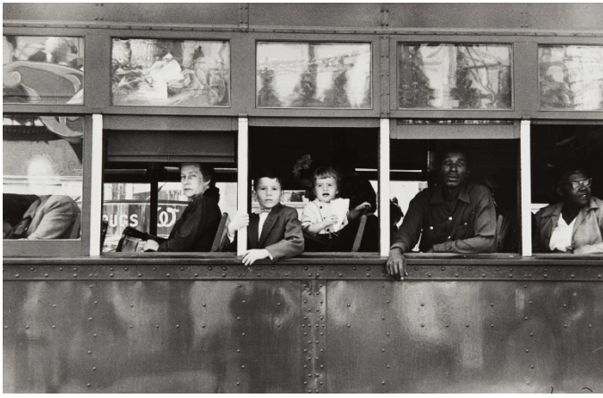
Robert Frank Trolley, New Orleans, 1955 Estimate: $120,000-180,000

Further, a suite of three iconic photographs from Robert Frank's The Americans is included in the auction. In 1986, The Metropolitan Museum of Art, New York, sought to acquire 27 prints from this important series for their permanent collection. To generate the funds needed for such a significant acquisition, The Met's Department of Photographs approached a small group of donors for assistance, who were later offered three prints from Robert Frank as a gift for their generous support. The three lots on offer - Trolley, New Orleans, 1955 (illustrated left), Chicago-Political Rally, 1956 , and US 285, New Mexico, 1956 (the latter two each estimated for $70,000-90,000) - come directly from one of the private collectors who helped to make this important museum acquisition possible.