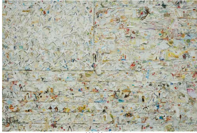
Vik Muniz White Flag, after Jasper Johns from Pictures of Magazines 2 , 2012 Estimate: $50,000-70,000