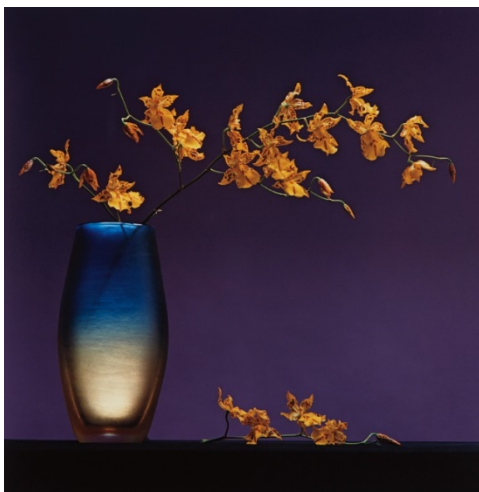
Robert Mapplethorpe Flowers in Vase, 1985 Estimate: $35,000-45,000