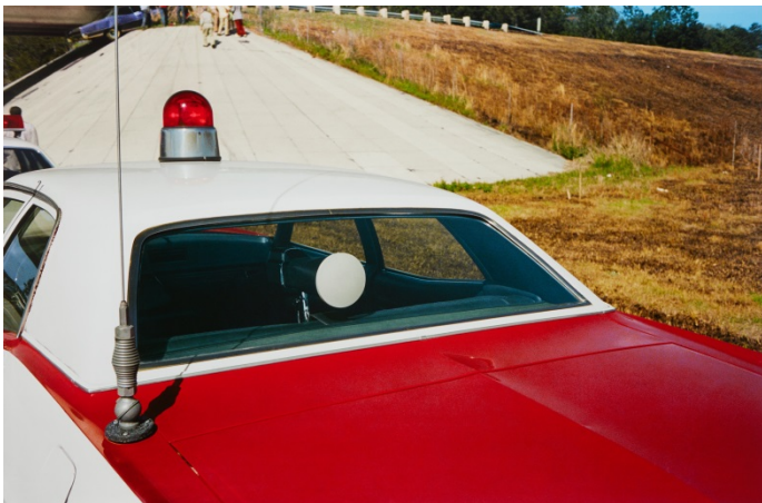
William Eggleston Untitled , 1971-1974 Estimate: $70,000-90,000

Additionally among the auction's top lots is William Eggleston's Untitled , 1971-1974 ( illustrated left ). From the photographer's 1970s series of acclaim, Los Alamos , this specific print is a contemporary reinterpretation of the original negative, printed in a stunning oversized format that further emphasizes Eggleston's famed use of saturated color that is held in universal regard. In this print, the bold colors, shapes, and planes intersect and repeat, creating a Kandinsky-like Modernist composition, which was captured through Eggleston's lens on the legendary roadway of the American highway.