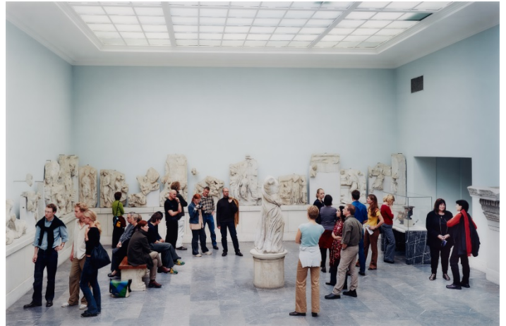
Thomas Struth Pergamon Museum IV, Berlin, 2001 Estimate: $100,000-150,000