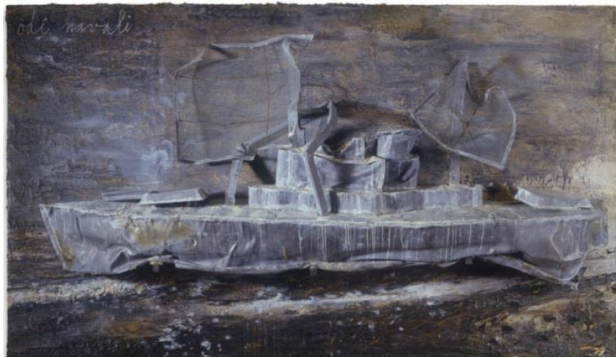
Anselm Kiefer b. 1945 Odi Navali , 1997 Estimate: £600,000 - 900,000

Grey Red by Sean Scully is a striking, large-scale composition by an artist recognised as a giant of contemporary abstract painting. Measuring over two meters in height, the picture is composed with the artist's favoured motifs of vertical stripes, applied in thick paint, resulting in a thick, textured surface. Executed in 2012, this work was selected by the artist to be shown that year at the 244th Royal Academy of Arts Summer Exhibition.