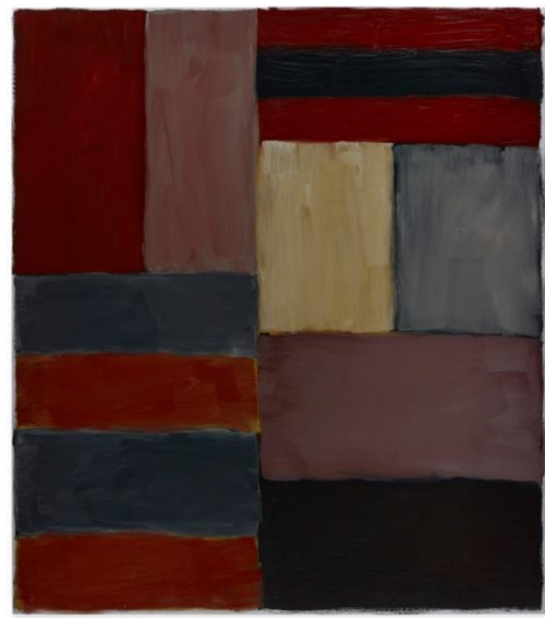
Sean Scully b. 1945 Grey Red , 2012 Estimate: £600,000 - 800,000

Mark Grotjahn's Untitled (White Butterfly Hawaiian Lapis) radiates bands of creamy hues, each creating a deception of space in a captivating play of optical effects. The present work hails from Grotjahn's renowned Butterfly Paintings series, which often incorporate two vanishing points in close proximity as the explosion of diagonal lines resemble a butterfly's wings.