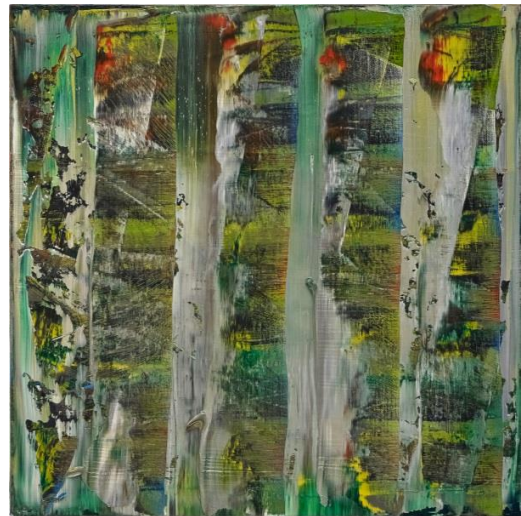
Gerhard Richter b. 1932 Abstraktes Bild (767-2) , 1992 Estimate: £800,000 - 1,200,000

Anselm Kiefer's Odi Navali is an exceptional example of the artist's sculpture-come-painting which is offered at auction for the first time having been in private collections since its execution in 1997. Engaging with twisted ideas and bitter motifs of the Second World War, the artist encapsulates in these works wild, uninhibited expression, implementing the demoniac tenets of war in order to best portray its grief. The present example is offered following the recent success of the artist's Für Velimir Khlebnikov: Die Lehre vom Krieg: Seeschlachten (2004-2010) which sold at Phillips London on 27 June 2016 for £2,389,000 ($3,153,480 / €2,866,800) against an estimate of £400,000 to £600,000.