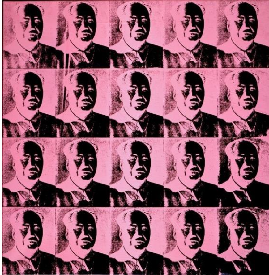
Andy Warhol (1928 - 1987) 20 Pink Mao's , 1979 Estimate: £4,000,000 - 6,000,000

LONDON - 22 SEPTEMBER 2016 - Phillips will bring together a selection of international names in the 20th Century & Contemporary Art Auctions on 5 and 6 October. This season's auctions are led by Pop icon Andy Warhol's 20 Pink Mao's (estimate: £4,000,000 - 6,000,000, illustrated above ), alongside important works by Mark Bradford, Sean Scully and Rudolf Stingel. Featuring 30 lots, the 20th Century & Contemporary Art Evening Sale will take place on 5 October and is estimated to total over £15 million. The 20th Century & Contemporary Art Day Sale comprises 158 lots and will take place on 6 October.