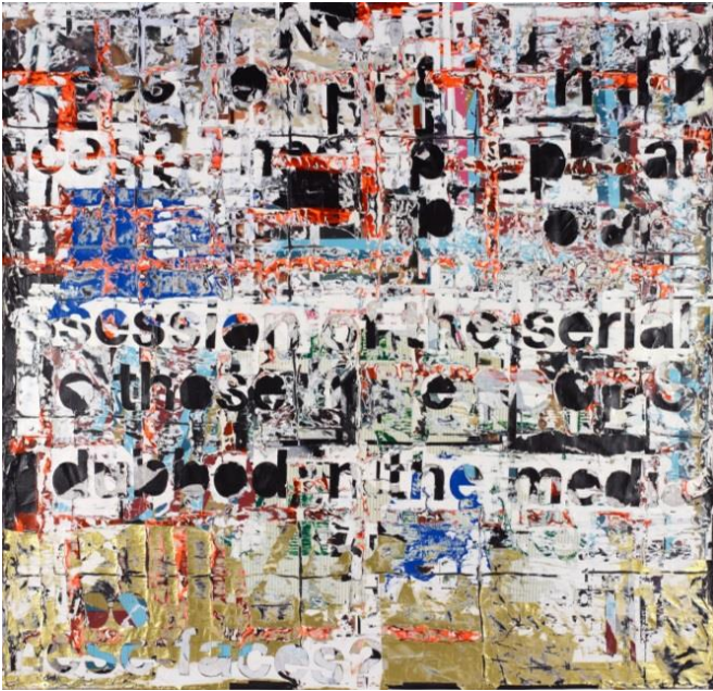
Mark Bradford b. 1961 Rat Catcher of Hamelin III , 2011 Estimate: £1,500,000 - 2,000,000

20 Pink Mao's by Andy Warhol was executed in 1979 and is offered at auction for the first time having been in the collection of the current owner for over a decade. Thought to be the rarest of Warhol's 'Reversal series', and arguably the most significant, these portrayals of Chairman Mao demonstrate a shrewd recalculation of one of the world's most ubiquitous portraits. Warhol first began creating paintings of Mao in 1972 using a widely circulated photograph from the Little Red Book, a pocket-sized index of quotations, thoughts and citations from Chairman Mao. The late 1970s and early 80s was a pivotal time for Warhol, forming a period of self-reflection that pushed him in critically rigorous and aesthetically potent new directions. It was then that he turned to his own oeuvre as a resource for new creative output; amalgamating earlier series' into single Retrospective canvases, revisiting the themes of his formative Dollar Bill works with an entirely fresh iconography, and creating his ominous series of Shadows that engaged with the subtle traces that all things leave behind. In the Reversal series, Warhol made his most direct and profound interventions using the most significant icons from his corpus such as Marilyn Monroe, the Mona Lisa, the Electric Chair and Chairman Mao. This self-appropriation casted a new perspective on the images that seemed most familiar of all.