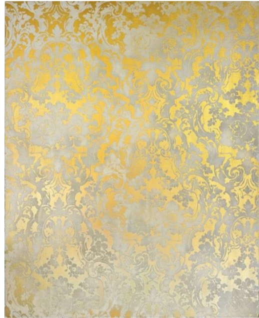
Rudolf Stingel b. 1956 Untitled , 2007 Estimate: £1,500,000 - 2,000,000

In recent years, Mark Bradford has emerged as one of the foremost contemporary artists of his generation. Following the strong prices achieved for three of his pictures at Phillips New York in May 2016, the present work is among the top lots of the Evening Sale. Rat Catcher of Hamelin III presents an abstract vision of life in Los Angeles as Bradford has experienced it; a disjointed urban chaos steeped in memories, conflicts and social injustice. Bradford has repurposed images posted on billboards, creating a densely layered piece frequently associated with his iconic works.