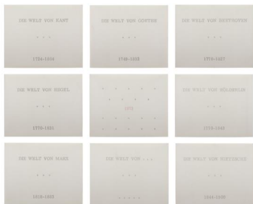
Marcel Broodthaers Die Welt , 1973 Estimate: £150,000 – 200,000