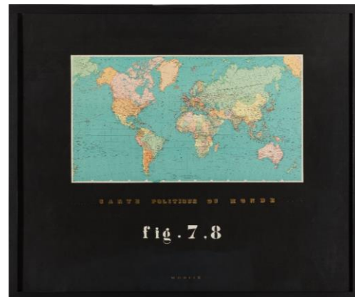
Marcel Broodthaers Carte politique du monde , circa 1970 Estimate: £15,000 – 20,000

Marcel Broodthaers (Belgian, 1924–1976) began his career as a writer and poet before transitioning to the visual arts at the age of 40. Over the next 12 years, he developed a distinctive visual language that encompassed surrealism and conceptualism. Broodthaers consistently explored the materiality of language, working across various mediums, including poetry, sculpture, painting, printmaking, and film. His work delved into a wide range of literary, social, and historical themes, creating an oeuvre rich with whimsical humour, semiotic puzzles, and strategies of repetition and self-deprecation. The artist's work maintained a poetic sensibility and wit within a conceptual framework, and his legacy continues to resonate in contemporary art.