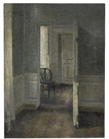
Vilhelm Hammershøi Interior with Windsor chair, 1913 29 x 21 1/2 in.