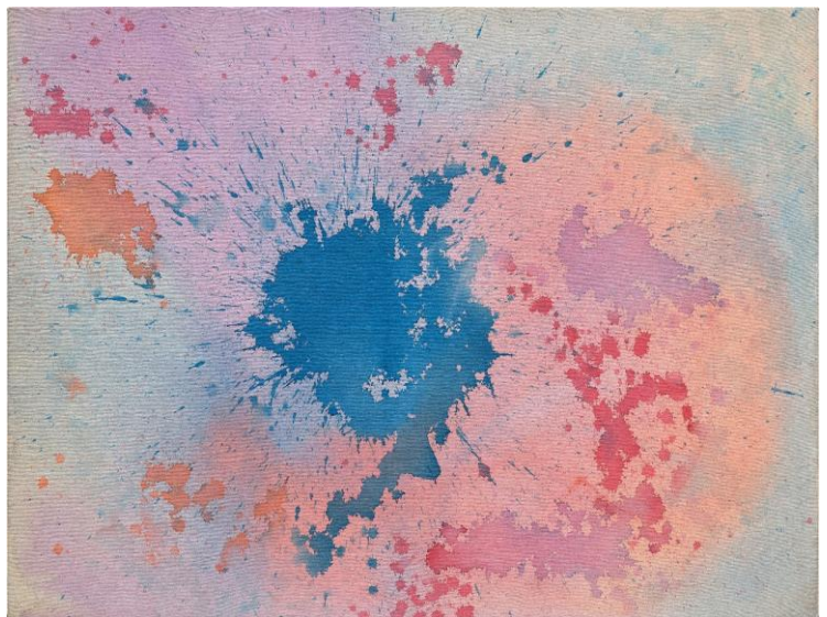
Untitled (VSF526), 1967 38 1/4 x 50 in. (97.2 x 127 cm)

Exhibition viewing: 2 June - 9 August 2023