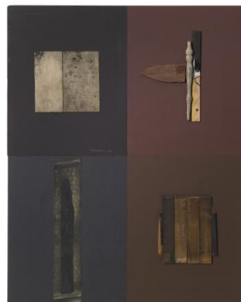
Louise Nevelson Senza titolo / Untitled, 1982 101.5 x 81.3 cm