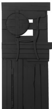
Louise Nevelson Senza titolo / Untitled, circa 1976 213 x 100 x 10 cm

MILAN – 3 April 2024 - Phillips is pleased to present Louise Nevelson. Beyond the Surface , a selling exhibition opening at Phillips Milan on 11 April 2024. This exhibition celebrates the legacy of acclaimed American Sculptor Louise Nevelson (1899-1988), a trailblazing figure and one of the most influential American sculptors of the 20th century. Born in Kyiv to Jewish parents, Nevelson's family immigrated to the US and eventually the artist settled in New York where she forged her own path to success, defying the odds in the predominantly male-dominated art world of the 20th century. Nevelson crafted her distinctive monochromatic wooden assemblages, collages, and sculptures by using found materials, including wooden discards such as dismantled chairs and table legs salvaged from the streets of New York City. Nevelson's work has been acquired by prestigious international institutions including Tate Gallery in London, and The Museum of Modern Art in New York. Featuring 15 significant pieces created by the artist between the 1960s and the 1980s, including her iconic and distinctive monumental black assemblages, Louise Nevelson. Beyond the Surface will be on view at Phillips Milan from 11 April to 30 June 2024.