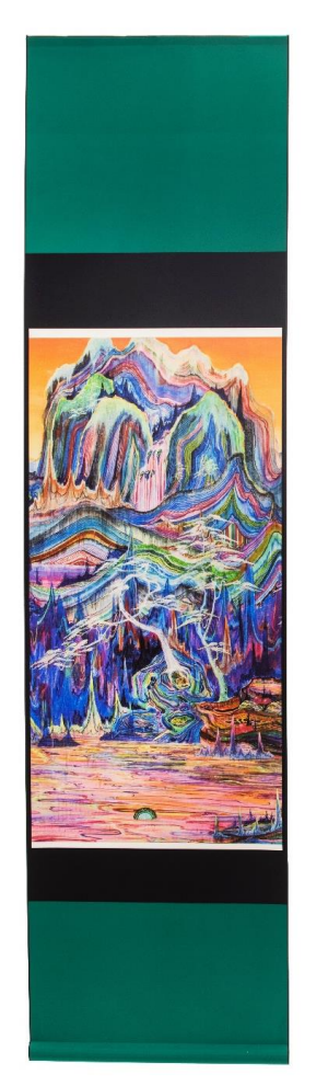
Endless miles of mountains and streams, 2024 This work is from an edition of 66 (Available for sale)

In addition to a series of exquisite works that express Huang Yuxing's passion for traditional Chinese landscape and craftsmanship, this exhibition also offers a work from the artist's well-known Bubble series. This series of works joyfully depicts Huang Yuxing's profound reflections on the experiences of time and space through visual metaphors of organic life forms. The Bubble series is an unapologetic celebration of Huang Yuxing's deep reflection on the human experience in time and space. Huang's artistic practice entails a longrunning investigation into the individual's life experience in parallel to the natural world. Stemming from reoccurring motifs of rivers and swirls in the artist's oeuvre, the Bubble series discusses the topic of dissolution, demonstrating a sense of eternity that underlies the ephemeral existence of bubbles themselves. The human experience is visually represented as bubbles caught in various states of motion, as fleeting and volatile as the temporary existence of an individual's life. Huang's signature approach during this period was to superimpose geometric forms delineated in thinly veiled neon colours to create delicate depth and texture, which is well-demonstrated in Bubbles.