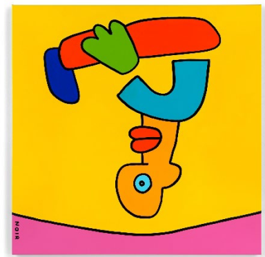
Trampoline , 2024 To be Offered in the PhillipsX Exhibition

Noir's Gold editions for Dropshop offer new mediums for the series that are exclusive to the platform. A suite of four ukiyo-e prints produced at the Adachi Institute of Woodcut Prints in Tokyo will be available, along with screenprint editions produced in London. Noir's ukiyo-e suite of Skateboarding , made using 400 year old traditional methods, is from an edition of 25 and will be offered for $5,000. The suite reflects the internationalism of the Gold project and a striking contrast between the old and new.