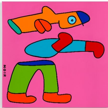
Boxing , 2024 To be Offered in the PhillipsX Exhibition