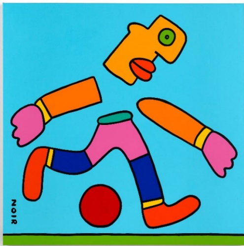
Football , 2024 To be Offered in the PhillipsX Exhibition