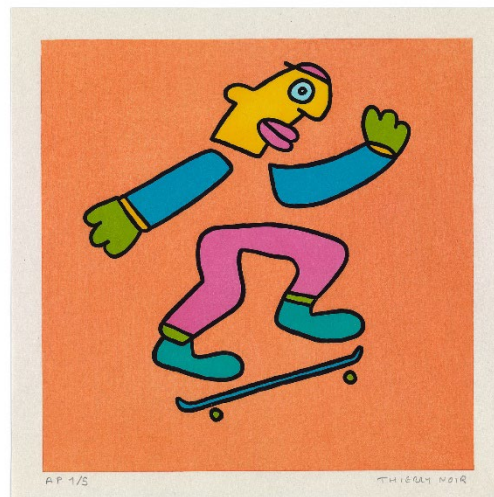
Skateboarding , 2024, ukiyo-e woodblock print To be Offered on Dropshop

NEW YORK – 18 JULY 2024 – This summer, Phillips is proud to showcase Thierry Noir as the July Dropshop artist alongside a solo exhibition taking place at Phillips' 432 Park Avenue international headquarters. Noir rose to worldwide acclaim in 1984 as the first person to paint murals on the Berlin Wall, with his works becoming integral to the cultural zeitgeist of Berlin in the 1980s. Now, Noir has created new artworks for Dropshop and a PhillipsX selling exhibition from his acclaimed Gold Series. Both the Drop and the exhibition, entitled Thierry Noir: Gold , will open on 25 July, with the works on Dropshop marking the first editioned artworks by Noir in eight years and the first time that works from a PhillipsX selling exhibition will be available for purchase using the same 'Buy Now' model as Dropshop.