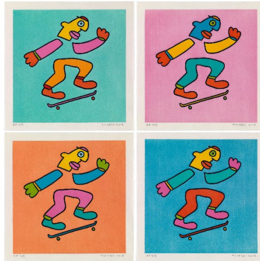
Skateboarding , 2024, Full Ukiyo-e Suite To be Offered on Dropshop