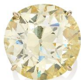
Fancy Intense Yellow diamond ring weighing 40.54 carats Estimate: CHF 850,000 - 1,290,000 / USD 980,000 – 1,500,000

Following the record-breaking success of the Geneva Jewels Auction in May 2024, where 'The Argyle Phoenix,' a rare fancy red diamond ring, sold for CHF 3,811,000 and set a new record price-per-carat for a fancy red diamond at auction (achieving USD 2.7 million per carat), Phillips is proud to present 'The Red Miracle.' This 1.21-carat fancy red diamond, coming to auction this November from an important private collection, represents an extraordinary opportunity as red diamonds over one carat are exceptionally rare.