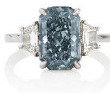
Fancy Dark Grey-Blue diamond ring weighing 3.88 carats Estimate: CHF 680,000 - 850,000 / USD 800,000 – 1,000,000