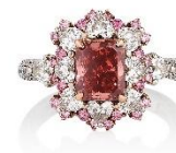
'The Red Miracle' Fancy Red diamond ring weighing 1.21 carats Estimate: CHF 420,000 - 680,000 / USD 500,000 – 800,000

The auction showcases an exquisite selection of vibrant coloured gemstones, including an 8.03-carat unheated Kashmir sapphire and diamond ring in a 'Trombino' design by Bulgari. Another notable piece is a 20.49-carat Colombian emerald ring, celebrated for its vivid saturation and deep colour and with no indications of clarity modification. Additional highlights include a pair of emerald and diamond earrings by Van Cleef & Arpels, set with cabochon emeralds weighing 19.08 and 18.92 carats, as well as a 1.36-carat fancy intense blue diamond.