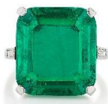
Cartier Very fine emerald and diamond ring weighing 14.65 carats, 1920s Estimate: CHF 750,000 - 1,000,000 / USD 900,000 – 1,200,000