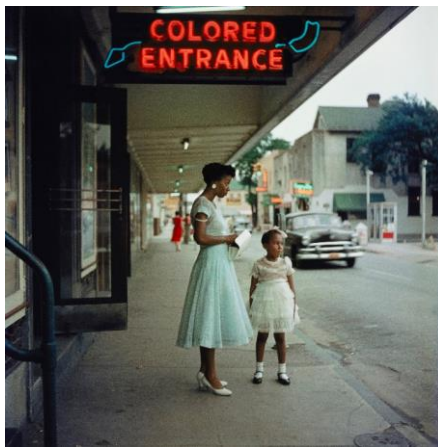
Gordon Parks Segregation Story , 1956 Estimate: $70,000-90,000 Three of Twelve Photographs in the Set

Proceeds to Benefit the Charitable Goals of the Foundation