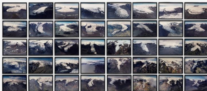
Olafur Eliasson The Glacier Series (40 prints), 1999 Estimate: $70,000-90,000