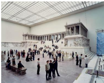
Thomas Struth Pergamon Museum 1, Berlin, 2001 Estimate: $120,000-180,000