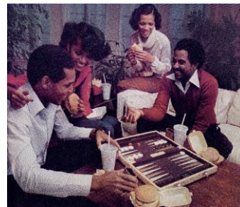
Hank Willis Thomas So Glad We Made It, 1977/2006 Estimate: $8,000-12,000