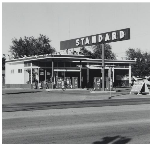
Ed Ruscha Gasoline Stations , 1962 Estimate: $100,000-150,000 One of Ten Photographs in the Set

Illustrating the multidisciplinary nature of the collection are several artists who work across media, including Olafur Eliasson, Awol Erizku, Christopher Wool and Ed Ruscha. Ruscha’s wry investigation of the manmade landscape