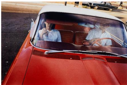
William Eggleston Untitled (Couple In Red Car At Drive-In Restaurant) Memphis, TN, 1965-1968 Estimate: $30,000-50,000