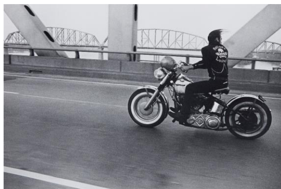
Danny Lyon The Bikeriders , 1962-1968 Estimate: $40,000-60,000 One of Fifty Photographs in the Set

Danny Lyon’s exploration of the motorcycle subculture of the 1960s, The Bikeriders , will also be featured in the April auction. An avid motorcyclist, Lyon joined the Chicago Outlaws Motorcycle Club, embedding himself within the closed world of the gang and creating one of the most complete documentary projects of the 20th century, comprised of 50 photographs. The sale at Phillips marks the first time that a full suite of 50 photographs will be offered at auction. A set of 76 photographs from Lyon’s study of Texas prisons, Conversations with the Dead , will also be offered, estimated at $50,000-70,000.