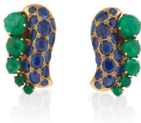
Suzanne Belperron Pair of sapphire and emerald ear clips Estimate: CHF 38,000-48,000 / USD 40,000-50,000

Further pieces that capture the pinnacle of craftsmanship and timeless allure include jewels by Suzanne Belperron and Van Cleef & Arpels, among others.