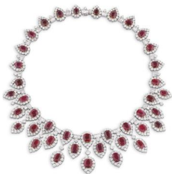
Ruby and diamond necklace, Burma, no heat, some pigeon blood colour Estimate: CHF 370,000-460,000 / USD 400,000-600,000

A magnificent selection of coloured stones takes centre stage in the auction, including a Burmese ruby and diamond necklace, with some pigeon blood colour rubies and all with no indications of heat. Another star lot is a large 9.01 carat unheated Mozambique ruby and diamond ring, as well as a Harry Winston sapphire and diamond necklace, featuring the iconic cluster design synonymous with Harry Winston's legacy of luxury and refinement.