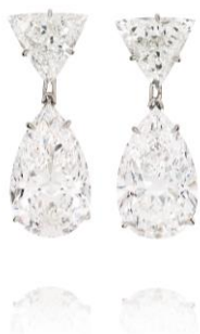
Pair of fine diamond earrings weighing 10.07 and 10.12 carats, D Colour, Flawless, Excellent Polish and Symmetry, Type IIa Estimate: CHF 1,160,000-1,640,000 / USD 1,275,000-1,800,000

Other exquisite examples of diamonds include a stunning pair of diamond earrings, each weighing 10.07 and 10.12 carats respectively, boasting D Color, Flawless clarity, and excellent polish and symmetry. These Type IIa diamonds are impeccably matched, with pear-shaped stones measuring 19.30 x 11.70 x 7.34mm and 19.50 x 11.70 x 7.31mm. Also featured is an important Fancy Vivid Yellow diamond ring weighing 27.27 carats, with excellent polish and symmetry, and a strong saturation that captivates the eye.