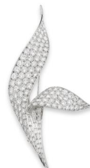
Sterlé Diamond brooch, 1960s Estimate: CHF 55,000-85,000 / USD 60,000-90,000

Further pieces that capture the pinnacle of craftsmanship and timeless allure include jewels by Suzanne Belperron and Van Cleef & Arpels, among others.