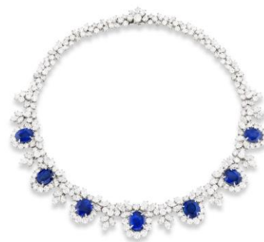
Harry Winston Sapphire and diamond necklace Estimate: CHF 170,000-240,000 / USD 180,000-260,000

Further highlights include a pair of sapphire and diamond earrings, including a 15.04 carat unheated Burmese sapphire and a 13.03 carat unheated Ceylon sapphire. Also radiating elegance is Harry Winston's 24.72-carat emerald and diamond pendant/brooch with faint clarity enhancement. Additional pieces include Kashmir sapphire and diamond ear clips weighing 2.48 and 2.68 carats, and a 5.03-carat no heat Burmese ruby and diamond ring.