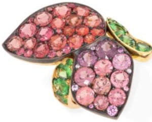
Maison Alix Dumas Diamond, spinel and sapphire Fleur de Magnolia brooch

Maison Alix Dumas' sculptural designs exude movement and sensuality, drawing inspiration from diverse sources to infuse touch and texture into each piece. Included in the selling exhibition is Dumas' Fleur de Magnolia diamond, spinel and sapphire brooch, a remarkable piece that saw the designer win the COUTURE Design Awards "Best in Haute Couture" category in 2023. A further highlight of the exhibition is Dumas' spinel, tsavorite and sapphire Eclosion ring.