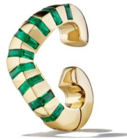
DYNE Gold and emerald Nemes ear cuff