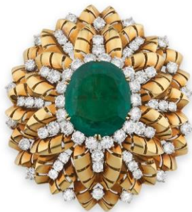
Harry Winston Emerald and diamond pendant/brooch Estimate: CHF 170,000-220,000 / USD 180,000-240,000