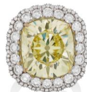
Fancy Intense Yellow diamond ring weighing 16.06 carats, VS1 Clarity Estimate: CHF 255,000-370,000 / USD 280,000-400,000