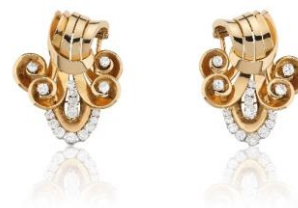
Van Cleef & Arpels Pair of gold and diamond clip brooches, circa 1940 Estimate: CHF 19,000-28,000 / USD 20,000-30,000