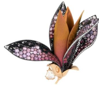
Maison Alix Dumas Spinel, tsavorite and sapphire Eclosion ring

DYNE seamlessly weaves jewels into a broader artistic narrative, employing symbols and vibrant gemstones to craft contemporary pieces imbued with an ancient aesthetic. Included among the DYNE pieces on offer in this exhibition are a peach gold and diamond Cinnamon ring and texturized band, a gold and emerald Nemes ear cuff, and a Candy ring.