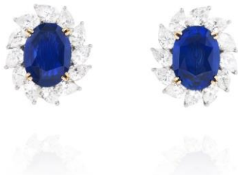
Pair of sapphire and diamond earrings, weighing 15.04 (Burma, no heat) and 13.03 carats (Ceylon, no heat) Estimate: CHF 140,000-220,000 / USD 150,000-240,000