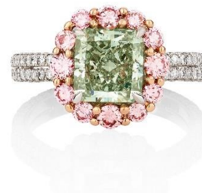
Fancy Intense Green diamond weighing 2.26 carats, VS1 Clarity Estimate: CHF 240,000-350,000 / USD 260,000-380,000