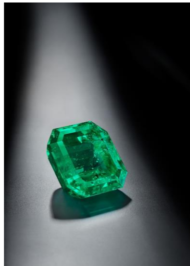
'The Amazon Queen' Impressive Colombian emerald weighing 280.84 carats, minor oil Estimate: CHF 1,360,000-2,360,000 / USD 1,500,000-2,600,000

Equally striking is 'The Argyle Phoenix', a Fancy Red diamond of 1.56 carats, sourced from the now-closed Argyle mines. Notable for its exceptional colour, its rarity is heightened by its Brilliant Cut, an unusual sight amongst red diamonds. It is accompanied by a GIA monograph, exemplifying the rarity and quality of the stone.