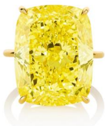
Important Fancy Vivid Yellow diamond weighing 27.27 carats Estimate: CHF 1,000,000-1,820,000 / USD 1,100,000-2,000,000