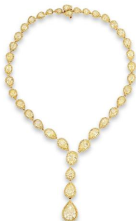
Harry Winston Fancy Intense Yellow and Fancy Yellow diamond necklace Estimate: CHF 275,000-460,000 / USD 300,000-500,00

Also featured is a Harry Winston Fancy Intense Yellow and Fancy Yellow diamond necklace. The largest fancy intense yellow diamond in the ensemble is a pear-shaped diamond weighing 11.28 carats with VVS2 clarity. Another treasure from the collection is a Fancy Intense Green diamond weighing 2.26 carats and boasting VS1 clarity.