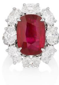
Ruby and diamond ring weighing 9.01 carats, Mozambique, no heat Estimate: CHF 185,000-270,000 / USD 200,000-300,000