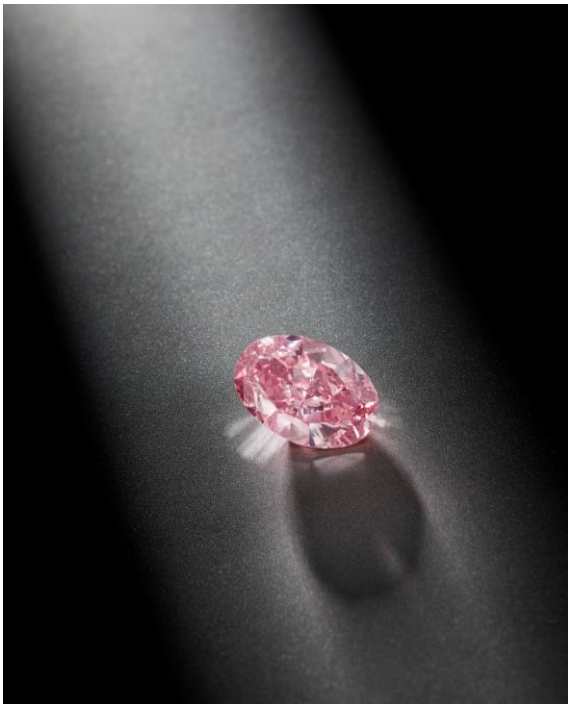
Fancy Vivid Pink diamond ring weighing 6.21 carats, VS1 Clarity, Type IIa Estimate: CHF 9,540,000-13,630,000 / USD 10,500,000-15,000,000

Alongside a 280.84 Carat Colombian Emerald, and an Exceptionally Rare 1.56 Carat Fancy Red Diamond