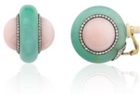
JAR Pair of chalcedony, pink opal and diamond ear clips Estimate: CHF 65,000-80,000 / USD 70,000-90,000