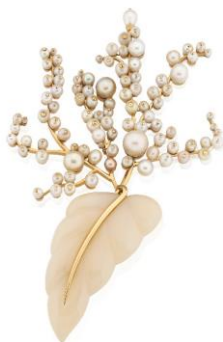
Suzanne Belperron Chalcedony, natural pearl and cultured pearl brooch, circa 1955 Estimate: CHF 42,000-60,000 / USD 45,000-65,000