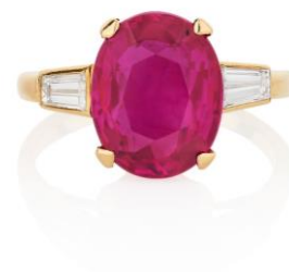
Ruby and diamond ring weighing 5.03 carats, Burma, no heat Estimate: CHF 115,000-140,000 / USD 125,000-150,000