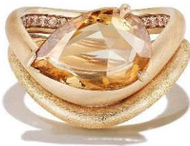
DYNE Peach gold and diamond Cinnamon ring and texturized band

DYNE seamlessly weaves jewels into a broader artistic narrative, employing symbols and vibrant gemstones to craft contemporary pieces imbued with an ancient aesthetic. Included among the DYNE pieces on offer in this exhibition are a peach gold and diamond Cinnamon ring and texturized band, a gold and emerald Nemes ear cuff, and a Candy ring.