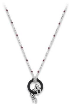
Cartier Diamond, ruby and onyx necklace, 'Panthère' Estimate: CHF 95,000-140,000 / USD 100,000-150,000

Among the signed jewel highlights showcased in this sale, Cartier's diamond, ruby and onyx 'Panthère' necklace is not to be missed. Exemplifying the classic Panther design, it encapsulates the timeless elegance and iconic style synonymous with Cartier. Adding to this splendor are JAR's pair of chalcedony, pink opal and diamond ear clips and Sterlé's diamond brooch from the 1960s.