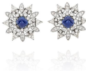
Pair of Kashmir sapphire and diamond ear clips weighing 2.48 and 2.68 carats Estimate: CHF 75,000-90,000 / USD 80,000-100,000