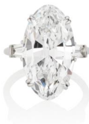
Diamond ring weighing 10.08 carats, oval, F Colour, VS1 Clarity Estimate: CHF 275,000-360,000 / USD 300,000-400,000