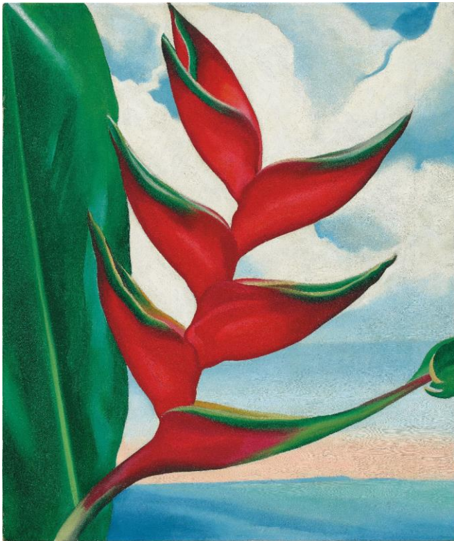
Georgia O’Keeffe Crab’s Claw Ginger Hawaii , 1939 Estimate: $4-6 million

Crab’s Claw Ginger Hawaii to be Featured in the November Evening Sale of 20th Century & Contemporary Art