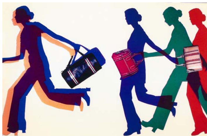
Travel Nova, 1971