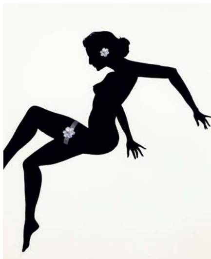
Jewelry Chandelier Champagne, Editorial, Japanese Vogue (with Van Cleef & Arpels flower garter and hair piece), 2003