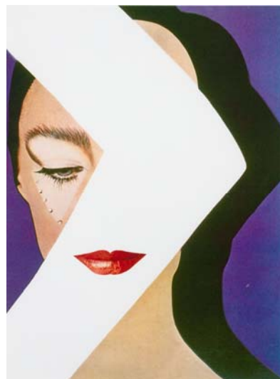
Max Factor Beauty Editorial, Harper's Bazaar, 1969