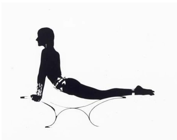
Pat on Silver, Jewelry Editorial, Harper's Bazaar, 1970