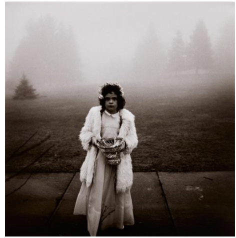
Diane Arbus A Flower Girl at a Wedding, Conn, 1964 Estimate: $20,000 - 30,000