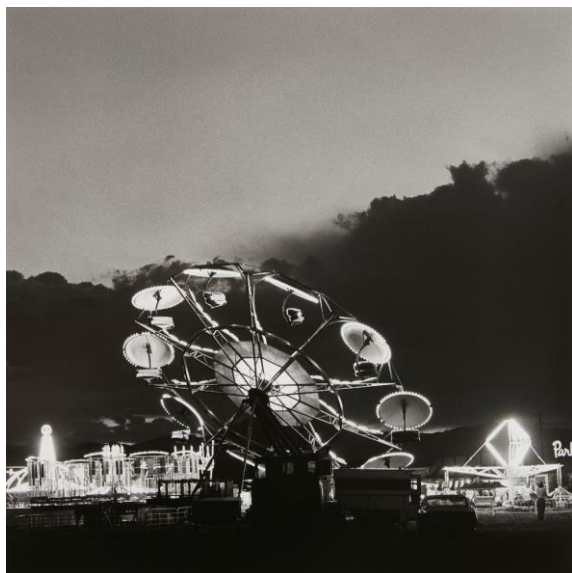
Robert Adams Longmont, Colorado (Summer Nights) , 1979 Estimate: $50,000 - 70,000

The collection boasts an impressive selection of 18 works by Robert Adams, including Southwest from the South Jetty, Oregon , 1990, a polyptych of five photographs documenting the ebb and flow of the South Jetty along the coast of Oregon. Adams' contemplative seascapes, landscapes and cityscapes highlight the exquisite beauty of the natural world even as it is being transformed by the effects of urban expansion, climate change and deforestation. Longmont, Colorado (Summer Nights) , 1979, captures this contrast in stark silhouette. The market for important photographs by Adams has strengthened in recent seasons and the sale of these works is particularly timely with the recently announced 2022 exhibition at the National Gallery of Art in Washington, DC.