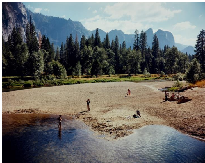
Stephen Shore Merced River, Yosemite National Park, California August 13, 1979, 1979 Estimate: $30,000 - 50,000

Peter Hujar's David Wojnarowicz Reclining (II) , 1981, is among the sale highlights and has never appeared before at auction. Hujar and Wojnarowicz were both central figures in the New York City art world in the 1980s. This intimate portrait embodies the beauty that lived alongside heartache as the gay community was ravaged by the AIDS epidemic, which ultimately took the lives of both the photographer and his subject. Also represented in the sale and known for their photographs of urban subcultures are Nan Goldin and Diane Arbus, including A Flower Girl at a Wedding, Conn. , 1964 and 6 works from Arbus's Untitled series from 1970-1971.