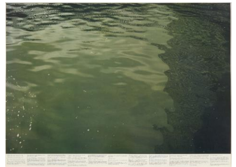
Roni Horn Still Water (The River Thames, For Example) Images: N, G, and H, 1999 Estimate: $20,000 - 30,000