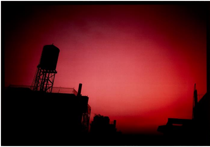
Nan Goldin Red sky from my window, NYC, 2000 Estimate: $12,000 - 18,000