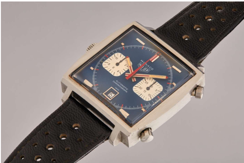
Heuer Monaco, Reference 1133. Circa 1969 Estimate On Request

To be Sold in RACING PULSE , the Flagship New York Watch Auction, on 12 December