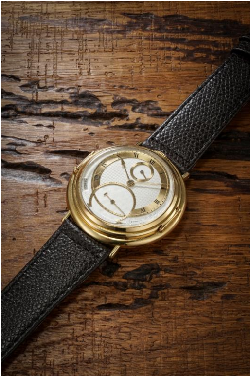
George Daniels, Spring Case Tourbillon in yellow gold Estimate: in excess of CHF 1 million

Watches to go on View at Geneva Watch Days from 29 August to 1 September