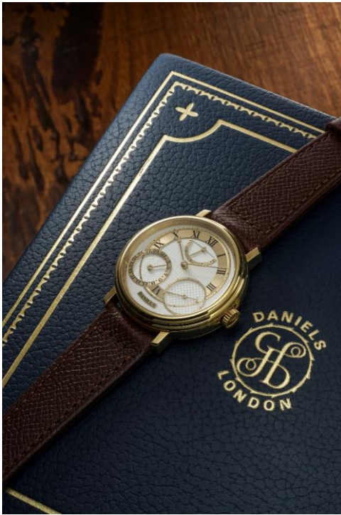
George Daniels, Anniversary Watch in Yellow Gold Estimate: CHF 300,000-600,000