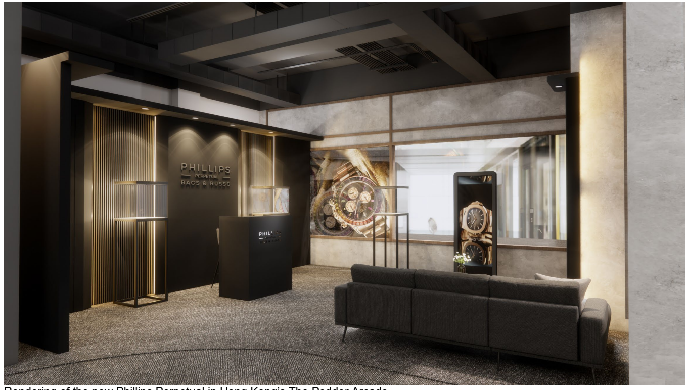
Rendering of the new Phillips Perpetual in Hong Kong's The Pedder Arcade

Phillips Watches will also Relocate its Office to the Pedder Building