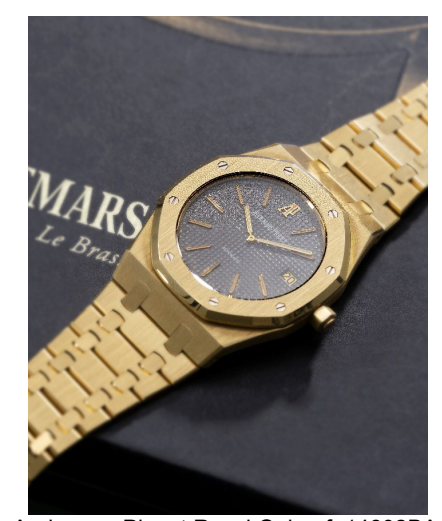
Audemars Piguet Royal Oak ref. 14802BA, circa 1994

Phillips' team of dedicated specialists will curate the Perpetual offering in Hong Kong with meticulous attention to detail, ensuring that each piece is a testament to the platform's commitment to quality and distinction. Phillips Perpetual Hong Kong will continue to expand its online presence, with future plans for integrating "Buy Now" capabilities, adding a new dimension of convenience for direct online purchases.