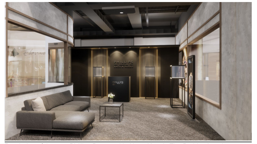
Rendering of the new Phillips Perpetual in Hong Kong's The Pedder Arcade

Taking inspiration from historic European shopping arcades, The Pedder Arcade aims to provide a sanctuary from the intensity of Hong Kong, providing a calm and sophisticated space for people to enjoy. The shops hosted by the arcade offer a complete shopping experience for the modern gentleman as well as some special items for ladies. Designed and curated by The Armoury and Katherine Wong Design, it features Phillips Perpetual, The Armoury, other stylish boutiques and a bar & café.