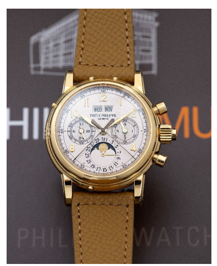
Patek Philippe ref. 5004J, circa 2010