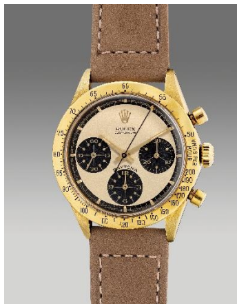
Rolex reference 6239

Other notable vintage Rolex timepieces from the sale including a reference 6236 in stainless steel, generally referred to as the "Jean-Claude Killy", named after the three-time French Olympic ski champion, who was often seen wearing a model 6236 like the present timepiece and it remains the most complicated movement ever made by Rolex. And an extremely rare GMT-Master reference 16750 made for the Royal Oman Police Force, which is one of four examples known in the market.