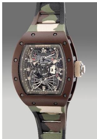
Richard Mille reference RM022 CA TZP.Z RME

A brown ceramic, carbon TPT tonneau-shaped dual-time, tourbillon, with function selector, power reserve and torque indication. Circa 2018.