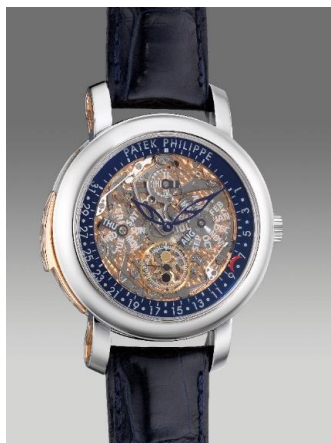
Patek Philippe reference 5104

Richard Mille launched the RM022 in 2010, adding an additional function GMT together with the tourbillon function. Since then, it has been re-released different time as a limited edition for various markets as well as various special materials. RM022 also known as 'Aerodyne' because of the use of aerospace materials. The baseplate with the 'honeycomb' pattern is cut out and created by a special material called orthorhombic Titanium aluminide for its extremely strong property and being lightweight as well. The present lot is made specially for the European market by Richard Mille, limited edition to 10 pieces and it is the first time publicly available in an auction market.