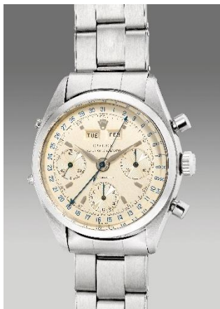
Rolex reference 6236

A stainless steel triple calendar chronograph wristwatch with 'no lumes' dial. Circa 1960.