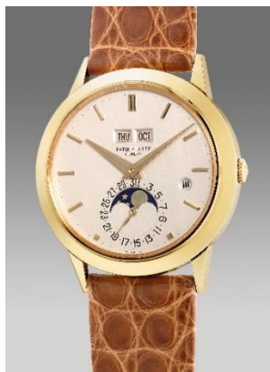
Patek Philippe reference 3450 A yellow gold perpetual calendar wristwatch with moon phases, leap year indicator, English calendar. Circa 1985. Estimate: HK$ 1,170,000-2,340,000