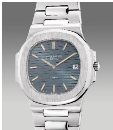
Patek Philippe reference 3700/001 A stainless steel wristwatch retailed by Gübelin. Circa 1970. Estimate: HK$620,000-1,200,000