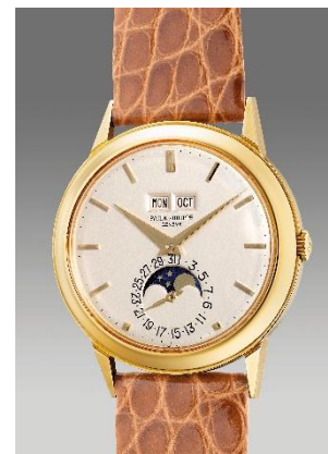
Patek Philippe reference 3448 A yellow gold perpetual calendar wristwatch with moon phases. Circa 1974. Estimate: 1,170,000-2,340,000

This season's sale will satisfy all the highly complicated Patek Philippe collector's finest taste, with an extraordinary selection of Patek Philippe timepieces, with highlights including: