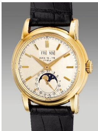
Patek Philippe reference 2438/1 A yellow gold perpetual calendar wristwatch. Circa 1955. Estimate: HK$ 1,400,000 – 3,000,000