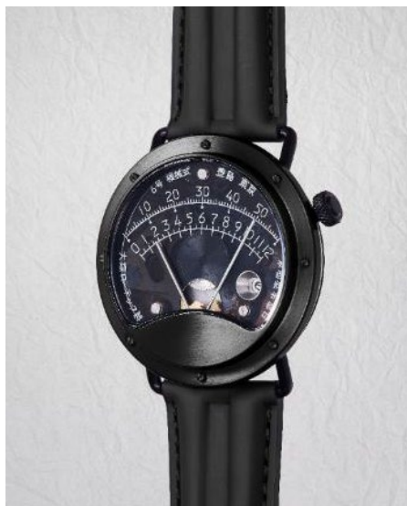
Otsuka Lotec by Jiro Katayama No.6 “SHINONOME” unique stainless steel semi-skeletonized wristwatch Circa 2024 Estimate: HK$ 15,000 - 45,000/ US$2,000-4,000

Kurono Tokyo’s “Grand” series pays homage to traditional Asian craftsmanship with its incredible Urushi lacquered dials. This ancient lacquer technique utilizes the filtered sap of the lacquer tree, a miraculous substance that absorbs moisture from the air as it hardens, resulting in a perpetually shiny and slick surface. Over time, Urushi becomes harder and more scratch-resistant, with the curing process continuing even after initial manufacture. The lacquer brightens with age as it loses moisture, which is a transformation that can take years. Also depending on the environment, the Urushi dial may change color, creating a unique piece if its own. The present Grand Niji “虹” is a unique piece made for the TOKI: Watch Auction . While past Kurono timepieces have been crafted in stainless steel, this watch is elegantly made in 18K pink gold. The dial is a marvel to behold, featuring layers of rainbow-colored Urushi crafted by Megumi Shimamoto, who has previously worked on Kurono's Urushi dials.