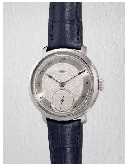
Masa's Pastime Nayuta Model A, unique stainless steel wristwatch Circa 2024 Estimate: HK$150,000 - 300,000/ US$20,000-40,000