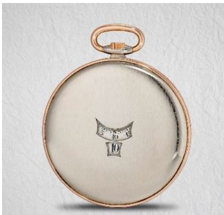
Breguet White gold and pink gold open-faced keyless digital pocket watch Circa 1926 Estimate: HK$150,000 - 320,000/ US$20,000-40,000