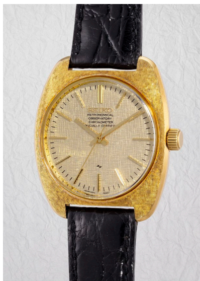
Seiko Astronomical Observatory Chronometer in yellow gold Circa 1970 Estimate: HK$160,000 - 310,000/ US$20,000-40,000