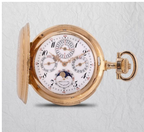
A. Lange & Söhne pink gold minute repeating perpetual calendar pocket watch Circa 1911 Estimate: HK$ 630,000 - 1,300,000/ US$80,000-160,000

The present Breguet pocket watch is a prime example, created during the Art Deco period. Encased in a remarkably rare two-tone 18K gold configuration, featuring both pink and white gold, this pocket watch is a true rarity in the world of Breguet horology. The elegant two-tone case of this Breguet pocket watch was crafted by the renowned Verger Frères, a master jeweler and horologist of the Art Deco era, as evidenced by the "V.F." stamp on the inner caseback.