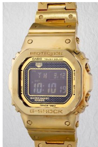
Casio G-Shock Dream Project “Pure Gold” ref. G- D5000-9JR solar-powered multifunction yellow gold wristwatch Circa 2021 Estimate: HK$200,000 - 400,000/ US$25,000-50,000