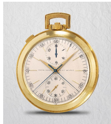
Patek Philippe Ref.837, yellow gold split-seconds chronograph open-faced keyless pocket watch Circa 1967 Estimate: HK$120,000-240,000/ US$15,000-30,000