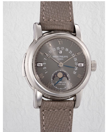
Patek Philippe Ref.5016, platinum minute repeating perpetual calendar tourbillon wristwatch Circa 1994 Estimate: HK$3,500,000 - 5,000,000/ US$450,000-650,000

Reflecting on the vintage watch boom in Japan during the 1990s, Rolex’s professional models stand out as iconic timepieces of that era. The Paul Newman dial of the Cosmograph Daytona, which ignited the boom, marked a significant shift in the criteria for evaluating watches in the secondary market from the 1990s to today. Fresh-to-market, the present Rolex ref. 6264 is an exceptionally rare example featuring the caliber 727. It is instantly recognizable with its creamy white backdrop and the “DAYTONA” insignia prominently displayed at the top of the register at six o’clock. This “Paul Newman” dial boasts attractive luminous plots that have aged uniformly to a buttery hue. This watch comes with an original warranty, Rolex Japan service papers, and a box.