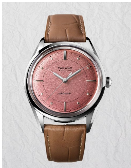
Takano Chateau Nouvel Chronometer “Tok” unique stainless steel wristwatch Circa 2024 Estimate: HK$50,000 - 100,000/ US$6,400-13,000