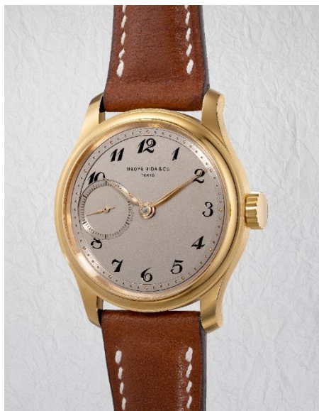
Naoya Hida & Co. Type 1D-2, unique yellow gold wristwatch Circa 2024 Estimate: HK$280,000 - 480,000/ US$35,000-60,000