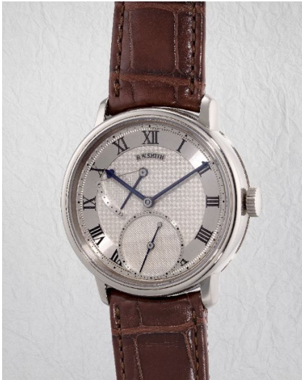
Roger Smith Series 2, Edition 3, white gold wristwatch Circa 2013 Estimate: HK$2,350,000 - 4,700,000/ US$300,000-600,000