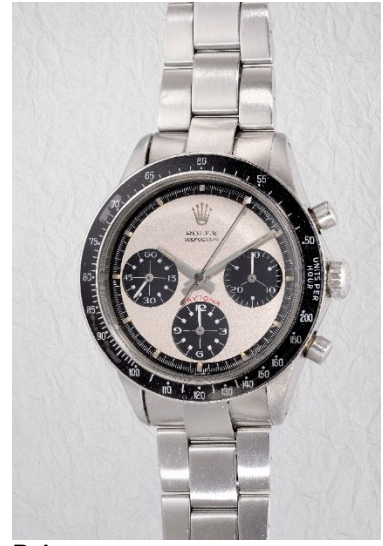
Rolex Ref.6264, Cosmograph Daytona "Paul Newman Panda" Circa 1970 Estimate: HK$1,400,000 - 2,400,000/ US$180,000-300,000