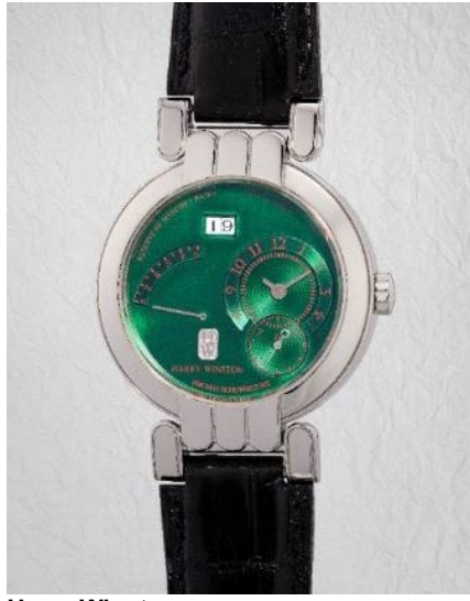
Harry Winston Opus One platinum wristwatch, made in collaboration with F.P. Journe (unique piece) Circa 2001 Estimate: HK$ 750,000 - 1,560,000/ US$100,000-200,000