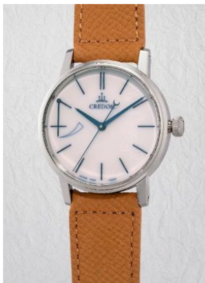
Credor Eichi, platinum wristwatch Circa 2010 Estimate: HK$ 280,000 - 430,000/ US$36,000-55,000

Magnificent and solid gold, the present G-Shock Dream Project “Pure Gold” G-D5000 watch was the first full yellow gold G-Shock launched in 2020 to celebrate Casio’s 35th-anniversary legacy. Weighing a whopping 297g, only 35 pieces were made, all of which were initially allocated to collectors via ballot in Japan. Extremely sought-after, the model was sold out and has become one of the most coveted G-Shock models ever made. Its functions include world-time, alarm, stopwatch, timer, and it is solar-powered. Moreover, its packaging celebrates Japanese culture. Its Kiri-Bako (paulownia wood box) is stamped with a Hanko seal, which translates to “Gravity Dream Project.”