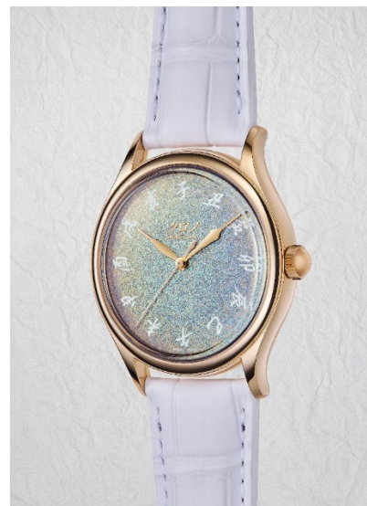
Kurono Tokyo by Hajime Asaoka Grand Niji “虹” unique pink gold wristwatch Circa 2024 Estimate: HK$70,000-140,000/US$9,000-18,000