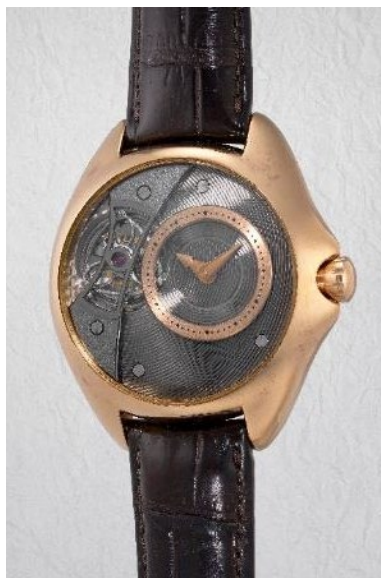
Masahiro Kikuno Unique pink gold tourbillon wristwatch Circa 2011 Estimate: HK$200,000-400,000/ US$25,000-50,000