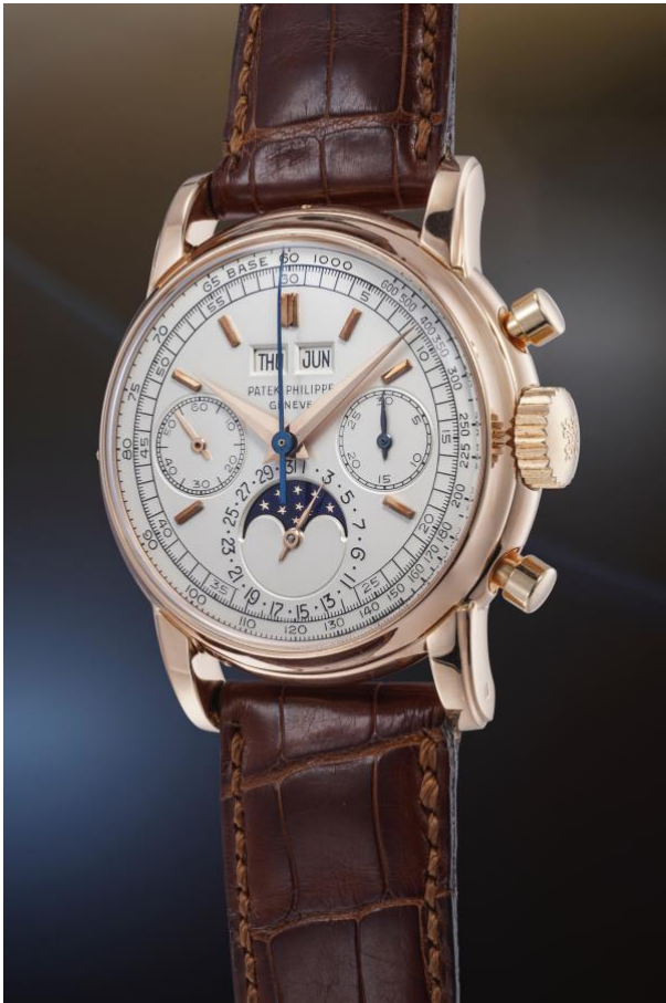
Patek Philippe reference 2499 second series in pink gold Estimate: CHF 1,500,000 to 3,000,000

GENEVA – 21 MARCH 2023 – Phillips in Association with Bacs & Russo is pleased to unveil highlights ahead of The Geneva Watch Auction: XVII. The sale features some of the rarest and most coveted examples of horology from across the 20th and 21st centuries. On offer are watches that will attract both the budding enthusiast and most seasoned collector, from a variety of price points. Highlights from the sale will tour to the public in New York, Hong Kong, Taipei, Singapore, and London. The preview will open in Geneva on 10 May before the live auction on 13 and 14 May at the Hôtel La Réserve.