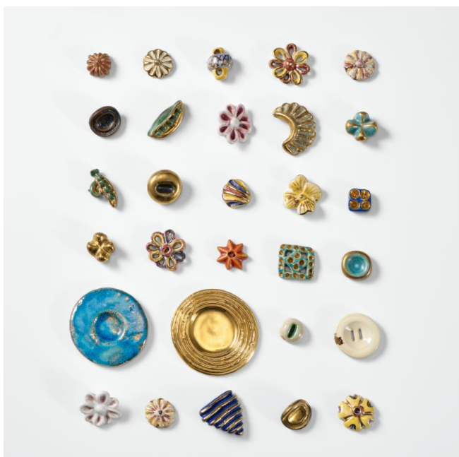
Lucie Rie 29 buttons and brooches, circa 1948 Estimate: £2,000 - 3,000

Initially, Coper's creations leaned towards large, powerfully thrown forms. Yet, due to declining health, his later work scaled down to a more manageable size. Coper's final group of works, collectively known as the 'Cycladic' series, are rare and finely crafted pieces that hold significant value for collectors. Seven 'Cycladic' pieces will be offered in this sale.