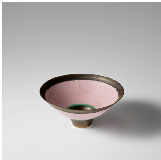
Lucie Rie Footed bowl , circa 1981 Estimate: £50,000 - 70,000