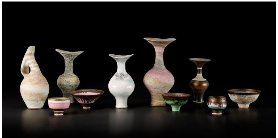
Lucie Rie, Selection of works