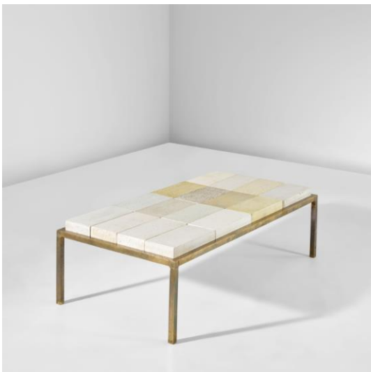
Lucie Rie and Vilmo Gilbello Coffee table , 1961 Estimate: £20,000 - 30,000