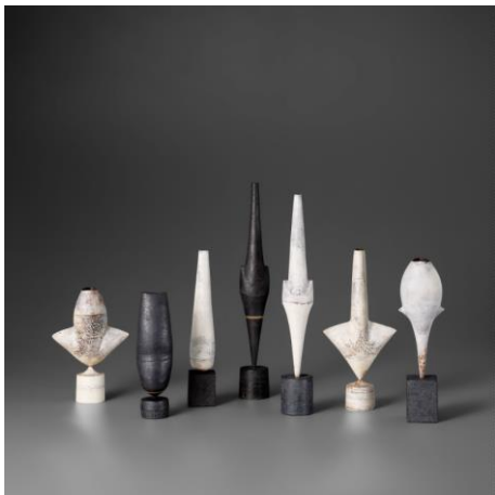
Hans Coper, Seven 'Cycladic' form works

To be Sold at Phillips London on 1 November 2023