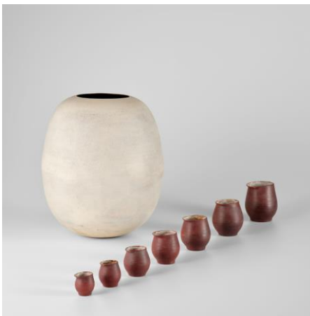
Hans Coper , Monumental ovoid pot , circa 1968 and Lucie Rie , Set of 7 graduated jugs , circa 1940

Two small, jewel-like blue bowls, one unusually stamped with the Bimini seal, represent rare examples of pots made during this period, and demonstrate the fluidity with which Rie shifted between making buttons and making pots.