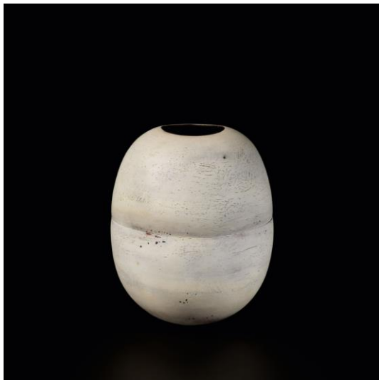
Hans Coper Large pot with indents , circa 1975 Estimate: £100,000 - 150,000