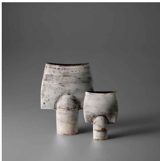
Hans Coper Large 'Spade' form, circa 1965 and 'Spade' form, circa 1965 Estimates: £60,000 - 80,000 and £30,000 - 50,000