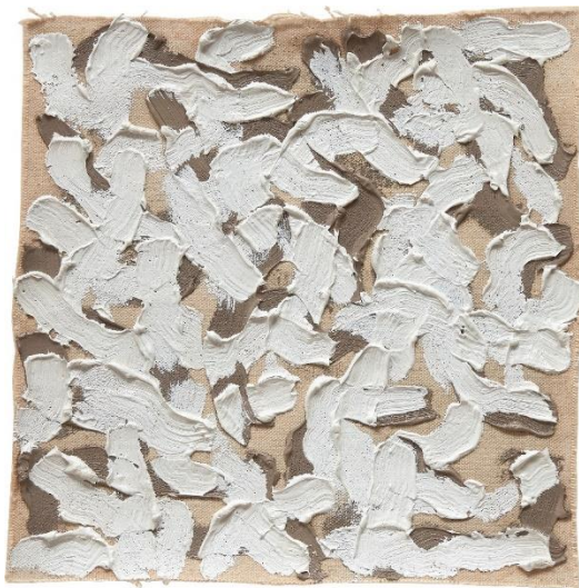
Robert Ryman Untitled, c. 1963-1964 Estimate: $1,000,000 — 1,500,000

Cobain and painted shortly after Cobain's death, the work reflects Peyton's fascination with fame, blending public persona with personal fragility. This portrait marked a pivotal moment in Peyton's career, where she captured the spirit at the turn of the 20th century through her depiction of popular figures, drawing on 'lives that are played out in the public arena of the mass media.' Peyton's portrait of a fellow portraitist, Alex (Alex Katz), Winter 2012 belongs to a rich tradition of artists painting other artists and is a highlight of the Modern & Contemporary Art Day Sale in New York.