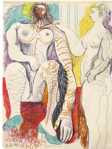
Pablo Picasso Nu debout et nu assis , June 2, 1970 Estimate: $500,000 – 700,000

A further highlight of the Modern & Contemporary Art Evening Sale in New York is Robert Ryman's Untitled , c. 1963-1964. Exemplifying his early exploration of painting's core elements —material, surface, and process— Untitled marked a shift toward abstract approaches in Ryman's practice. The unstretched canvas and textured layers of white paint, subtly revealing muted taupe, highlight the artist's focus on the interaction between paint and light. His use of the square format allowed him to concentrate on the materiality of painting, a technique influenced by his background in jazz improvisation. Untitled was showcased in a major retrospective celebrating Ryman's 70th birthday, which opened at the Haus der Kunst in Munich in 2000 and traveled to the Kunstmuseum Bonn in 2001. Comparable works from this formative period in Ryman's career reside in the permanent collections of respected institutions such as the Museum of Modern Art, New York, and the Dia Art Foundation, Beacon.