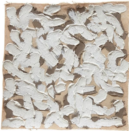
Robert Ryman Untitled , c. 1963-1964 Estimate: $1,000,000 — 1,500,000

Cobain and painted shortly after Cobain's death, the work reflects Peyton's fascination with fame, blending public persona with personal fragility. This portrait marked a pivotal moment in Peyton's career, where she captured the spirit at the turn of the 20th century through her depiction of popular figures, drawing on 'lives that are played out in the public arena of the mass media.' Peyton's portrait of a fellow portraitist, Alex (Alex Katz) , Winter 2012 belongs to a rich tradition of artists painting other artists and is a highlight of the Modern & Contemporary Art Day Sale in New York.