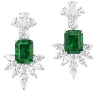
A Pair of 8.13 carat and 8.27 carat Zambian Emerald and Diamond Earrings Estimate: HK$480,000–680,000/ US$61,000-87,000