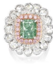
A 3.19 carat Fancy Deep Green Diamond and Diamond Ring

Estimate: HK$3,200,000 – 4,800,000/ US$400,000-600,000