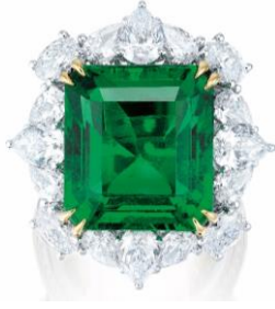
A 16.48 carats Zambian Emerald and Diamond Ring Estimate: HK$950,000 – 1,500,000/ US$120,000-200,000