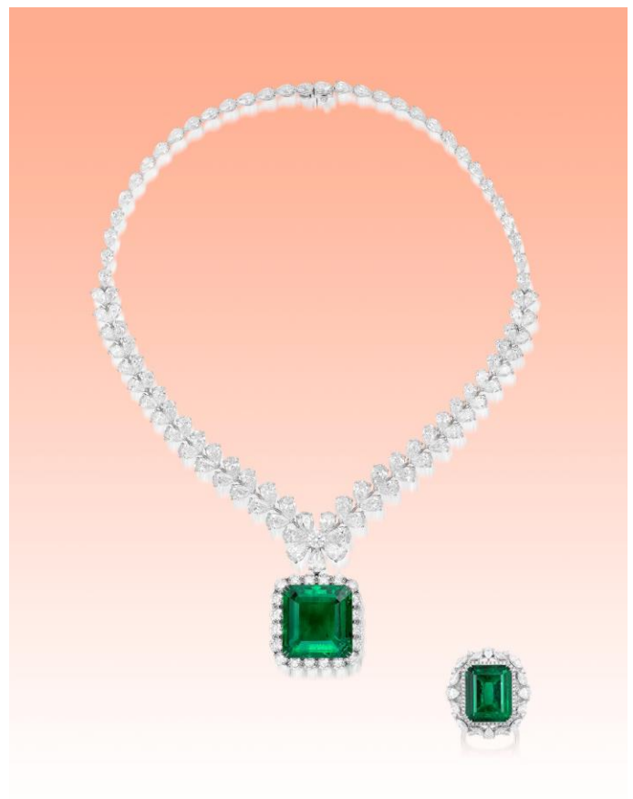
A Zambian Emerald and Diamond Necklace and Ring

Necklace: Estimate HK$650,000-850,000/ US$83,000-110,000 Earrings: Estimate HK$250,000-350,000/ US$30,000-45,000 Bracelet: Estimate HK$360,000-460,000/ US$45,000-60,000 Ring: Estimate HK$360,000-460,000/ US$46,000-60,000