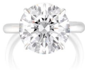
A 7.07 carat D/Flawless Diamond Ring

Estimate: HK$3,200,000 – 4,800,000/ US$400,000-600,000