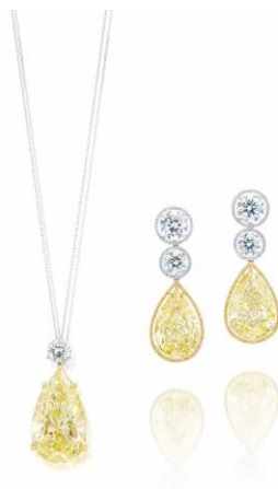
A 25.01 carat Fancy Yellow Diamond and Diamond Pendant Necklace

Estimate: HK$2,400,000–3,400,000/ US$300,000-440,000