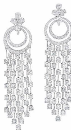
Graff, A Pair of Diamond 'Waterfall' Earrings

Estimate: HK$2,000,000-3,000,000/ US$250,000-380,000