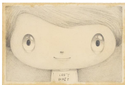
Javier Calleja Can't Wait (#19) , 2017 watercolour and pencil on paper, 10.2 x 15.3 cm. Estimate: HK$180,000-280,000/ US$ 22,500- 35,000