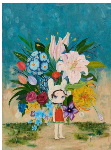
Jade Kim Flower Aura , 2021 oil on canvas, 130 x 97cm. Estimate: HK$90,000-130,000/ US$ 11,250-16,250

The bidding opens on 2 February at 9pm HKT and will begin closing on 9 February at 6pm HKT.