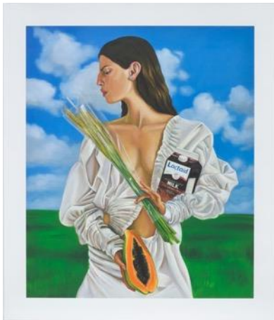
Chloe Wise Gluten Freedom, 2017 Estimate: £800 – 1,200