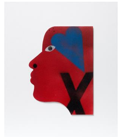
Nina Chanel Abney Untitled, 2016 Estimate: £4,000 – 6,000