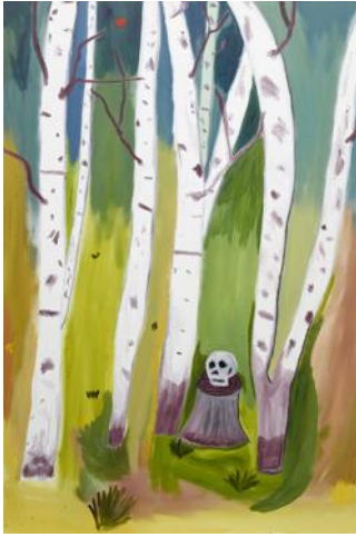
Marcus Jahmal Wilderness Nightfall, 2017 Estimate: £10,000 – 15,000