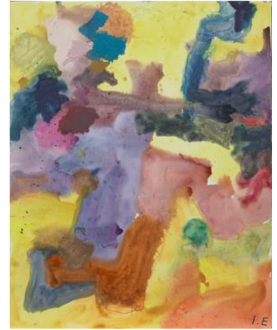
Ida Ekblad Toot Gameland Clatter Bang, 2013 Estimate: £10,000 – 15,000