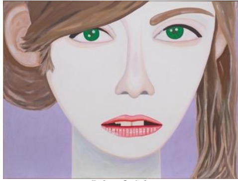
Brian Calvin Simple Twist, 2016 Estimate: £18,000 – 25,000