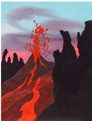
Ken Price Continuous Unobserved Eruption, 2006 Estimate: £15,000 – 20,000