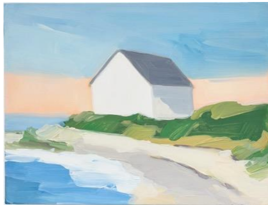
Maureen Gallace Early October, 2009 Estimate: £5,000 – 7,000