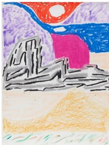
Shara Hughes Moonlight Cragg Rock, 2016 Estimate: £3,000 – 5,000