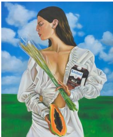
Chloe Wise Gluten Freedom, 2017 Estimate: £800 – 1,200