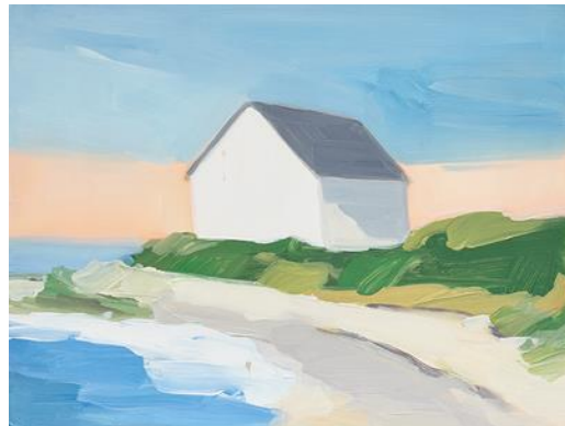
Maureen Gallace Early October, 2009 Estimate: £5,000 - 7,000