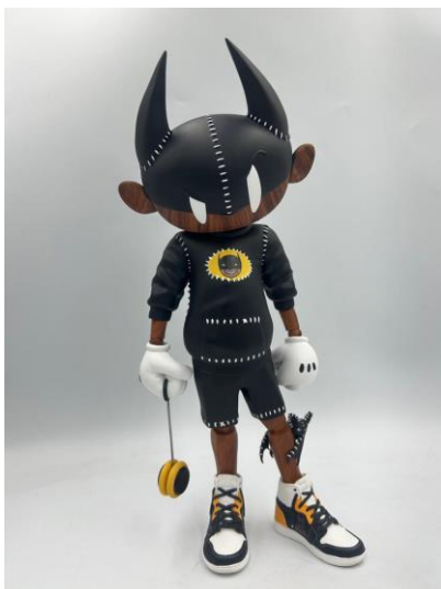
Brett Crawford YOYO (batboy) polystone, height 32 cm, Edition of 350 Price: HK$ 4,700

Brett Crawford is a multidisciplinary artist whose art practice spans across painting, sculpture, design, and street murals; each of his work is a cultural exchange between art, fashion, and street culture. Playing with fairy tale imagery and surreal settings, Crawford's works are populated with pop references and contemporary icons that inspire the underlying sentiments of contemporary society.