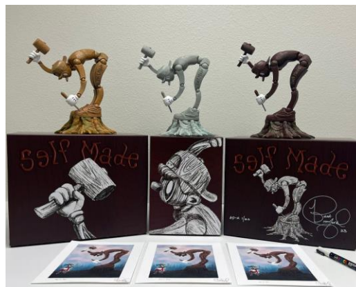
Brett Crawford S3LF MADE (Figure) Price: HK$ 10,000

Exhibition: 10am to 6pm, 9-22 June, 2023