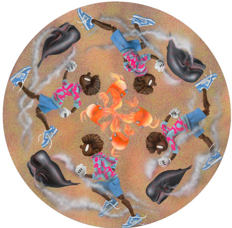
Brett Crawford R3VOLVE , 2023 acrylic on linen over wood panel, 152.5 x 152.5 cm.

HONG KONG – 17 May 2023 - Phillips is pleased to present WAST3D POT3NTIAL in Hong Kong, a selling exhibition of works by Southern California based artist Brett Crawford , following the tremendous success of a pop-up exhibition featuring works by the artist in Singapore this January. Taking place at Phillips' new Asia headquarters in Hong Kong's West Kowloon Cultural District from 9 to 22 June, the exhibition marks Crawford's first solo show in Asia, featuring a series of canvases and sculptures that are available for purchase through Phillips' Private Sales.