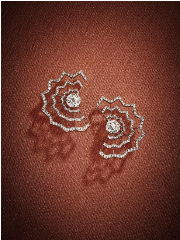
Half Chevron earrings featuring two old mine diamonds

On View at 30 Berkeley Square from 19 to 23 September