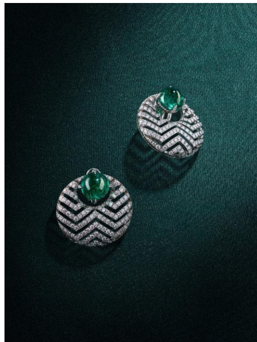
Columbian emerald and diamond Chevron earrings