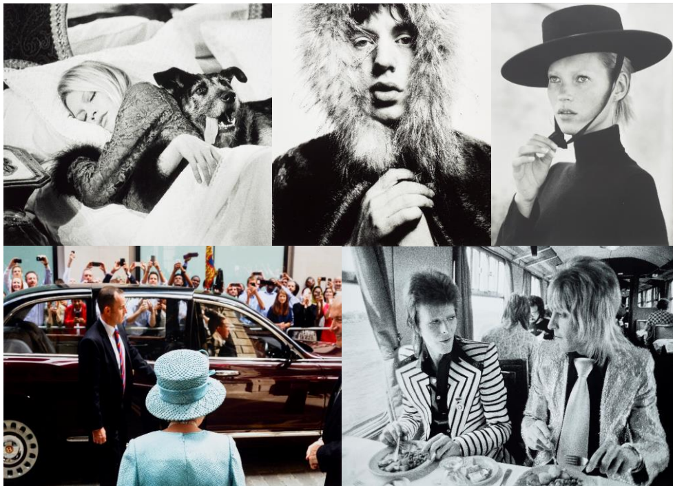
A Selection of highlights from across the sale

Featuring an Exclusive Curation of Iconic Works Including those by Terry O'Neill, David Bailey, Bruce Weber, Henri Cartier-Bresson, Martin Parr, and Mick Rock