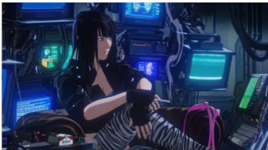
Maciej Kuciara Her Body is Metal , 2022 MP4: 369.2MB, 00:40 Bidding starts at HK$1,000