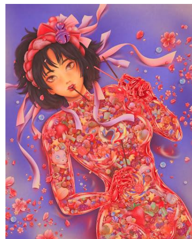
Lili Tae Love, Me , 2022 JPG: 9.6MB Bidding starts at HK$1,000