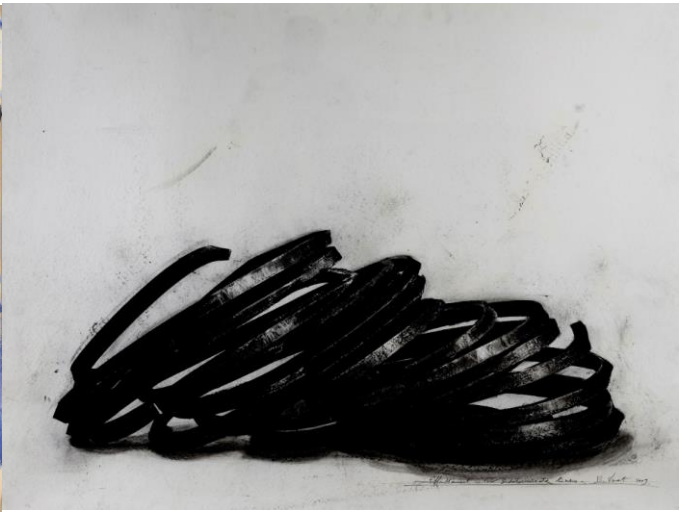
Bernar Venet Effondrement - Four Indeterminate Lines , 2009

PARIS – 4 OCTOBER 2023 – PhillipsX is pleased to announce Modeler le papier // Shapes on paper , a selling exhibition focused on drawings, studies, and works on paper by leading sculptors of the 20th and 21st centuries. From Alexander Calder to Bernar Venet, and Henry Moore to Anish Kapoor, this exhibition will explore how artists who are renowned for working in three-dimensions have explored their work on paper. Including sketches, studies, gouaches and drawings, Modeler le papier // Shapes on paper takes a deep dive into the works on paper produced by acclaimed artists traditionally known for their sculptures and delves into the dialogues between their cross-disciplinary modes of expression. The selling exhibition is live online and will be on view in Phillips' Paris galleries from 4 to 31 October.