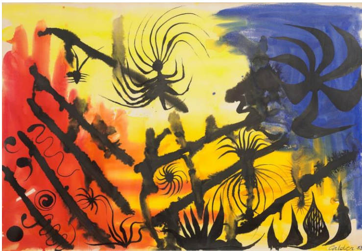
Alexander Calder Diluvial , 1953

A Selling Exhibition Focused on the Drawings, Studies, and Works on Paper of Some of the Most Widely Recognised and Acclaimed Sculptors of the 20th and 21st Centuries