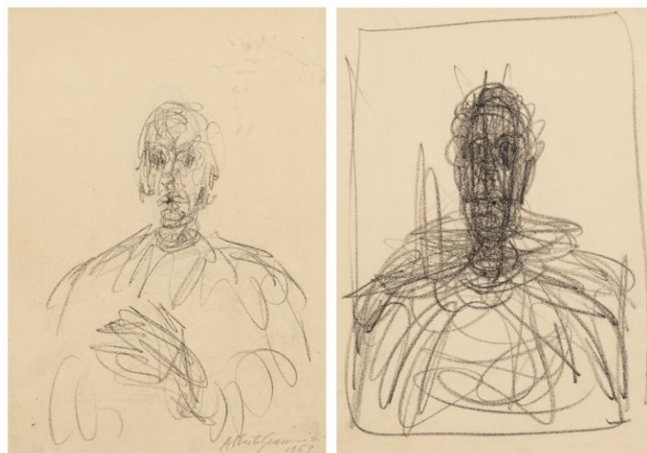
Alberto Giacometti Buste D'Homme , 1951

A highlight of the exhibition is Alberto Giacometti's Buste d'homme le bras gauche levé (recto) / Buste d'homme dans un cadre (verso) . Executed in 1951, this double portrait demonstrates Giacometti's commitment to exploring the representation of his subjects across different disciplines. His drawings, which were particularly prolific at this later period of his career, capture a particular transience. As with Giacometti's acclaimed slender sculptural forms, the subjects of this work is drawn with thin, fluent lines which suggest a dreamlike sense of fleeting weightlessness.