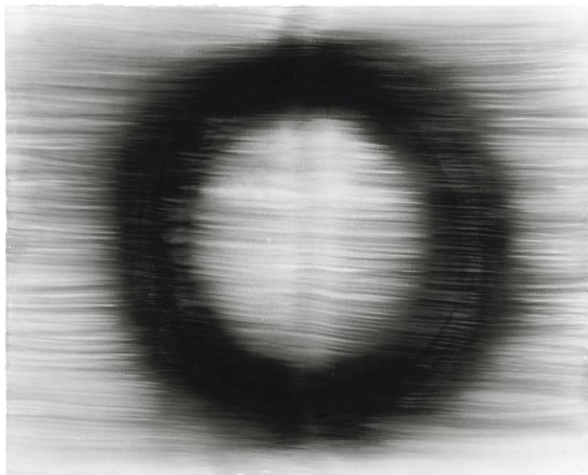
Anish Kapoor Untitled (Circle), 1996

Further highlights of the exhibition include works on paper by Anish Kapoor, Marino Marini, Niki de Saint-Phalle, Julio González, Chiharu Shiota, Auguste Rodin, Anthony Gormley, Sol Lewitt, Nobuo Sekine, Aristide Maillol.