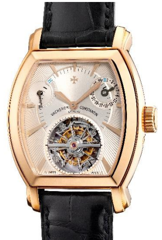
Vacheron Constantin Pink gold tourbillon-shaped wristwatch with power reserve indication and date. Estimate: HK$230,000 – 390,000