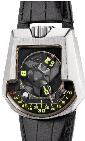
Urwerk UR-202 WG, A titanium and white gold wristwatch with revolving satellite complication, telescopic minute hands, twin-turbine winding system, moon phases and day/night indication. Estimate: HK$200,000 -310,000