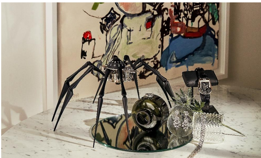
Eddie Martinez , EMHK WOP13 , 2019, acrylic, oil and watercolour on paper. Estimate: HK$90,000-120,000