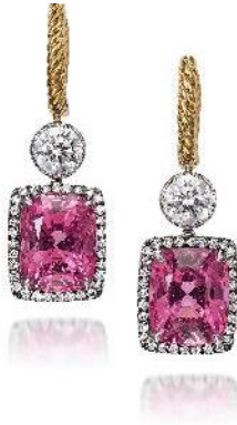
A Pair of Pink Spinel and Diamond Earrings Estimate: HK$78,000-98,000