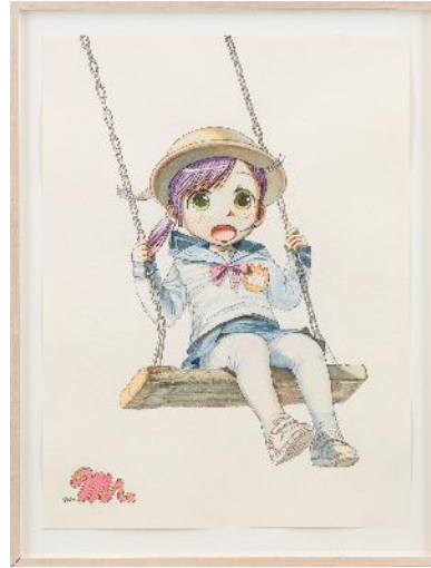
Mr. Swing , 2010, watercolour and pencil on paper Estimate: HK$180,000.00 - 280,000.00