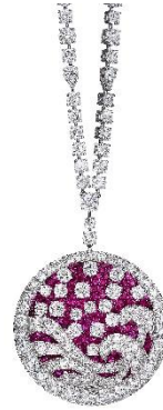
GRAFF A Ruby and Diamond Pendant Necklace Estimate: HK$700,000-900,000