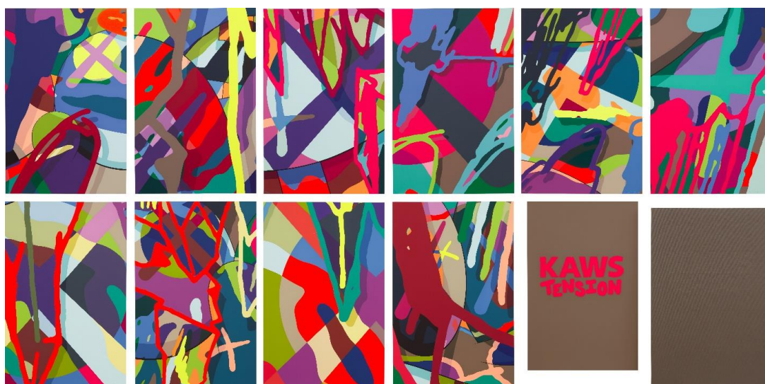
KAWS TENSION , 2019, set of 10 screenprints in colours on Saunders Waterford paper Estimate HKD500,000 - 700,000