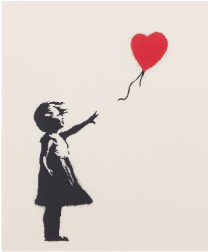
Banksy Girl with Balloon , 2014, screenprint in colours Estimate: HK$450,000-650,000