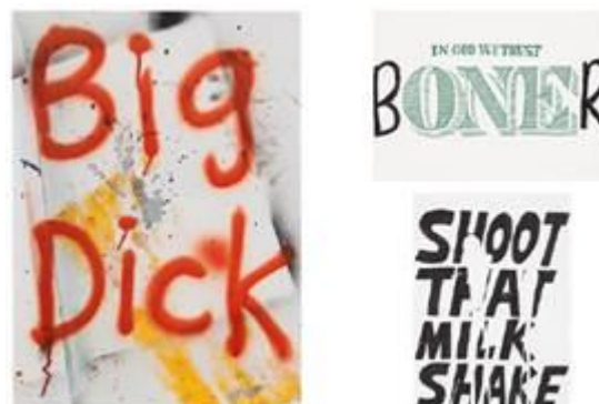
MADSAKI BIG DICK , 2013, acrylic and spraypaint on paper Estimate: HK$ 40,000 - 60,000 Two Works: (i) BONER ; (ii) SHOOT THAT MILKSHAKE , 2013, acrylic, marker and pencil on paper Estimate: HK$ 60,000 - 80,000