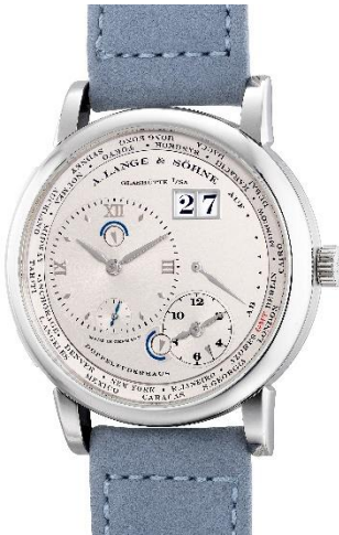
A. Lange & Söhne A platinum dual time wristwatch with large date, double day/night indication, and power reserve indication. Estimate: HK$ 155,000 - 310,000