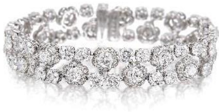
GRAFF A Diamond Bracelet Estimate: HK$ 550,000-850,000