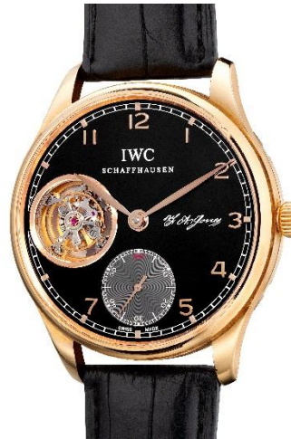
IWC A very fine and rare limited-edition pink gold tourbillon wristwatch with small seconds, numbered 437 of a limited edition of 500 pieces. Estimate: HK$200,000-280,000