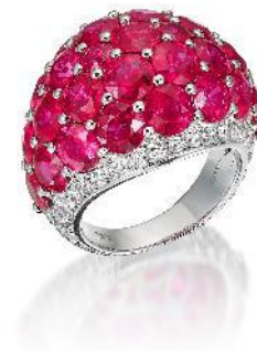
GRAFF A Diamond and Ruby Ring Estimate: HK$280,000-480,000