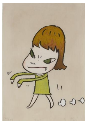
Yoshitomo Nara Walk On (M. & S. E-2010-012), 2010 Estimate: HK$300,000-500,000/ US$38,500-64,100