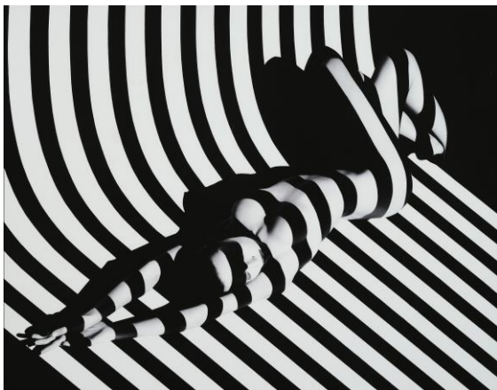
Francis Giacobetti Zebra #17, 1988