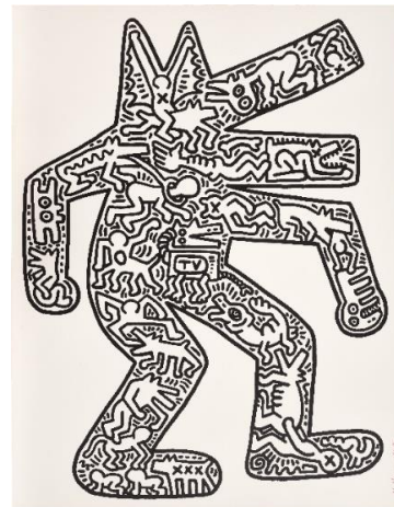
Keith Haring Dog (L. pp. 48-49), 1986-87 Estimate: HK$500,000 - 700,000/ US$64,100-89,700