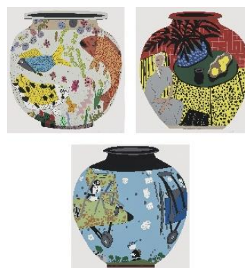
Jonas Wood Fish Pot; Matisse Pot 4; and Snoopy Pot , 2019-2020 Estimate: HK$400,000-600,000/ US$51,300-76,900