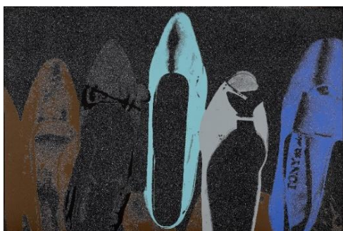
Andy Warhol Shoes (F. & S. II.257), 1980 Estimate: HK$500,000 - 700,000/ US$64,100-89,700