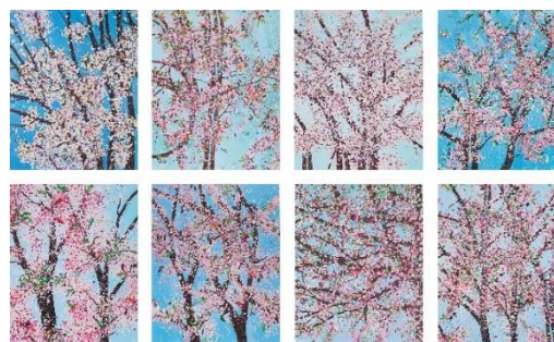
Damien Hirst The Virtues (H9), 2021 Estimate: HK$600,000-800,000/ US$76,900-103,000