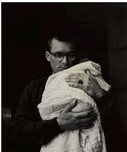
Second Born, Berkeley, 1955 Estimate: $5,000 - 7,000