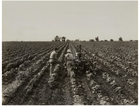
Paul S. Taylor with Farmer, circa 1936 Estimate: $3,000 - 5,000

Online Auction: 29 March - 5 April Auction Viewing: 432 Park Avenue, New York, NY 10022