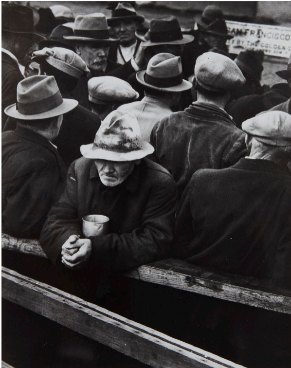
White Angel Breadline, San Francisco, 1933 Estimate: $15,000 - 25,000

Session to be Open for Bidding from 29 March to 5 April Alongside Public Exhibition at 432 Park Avenue