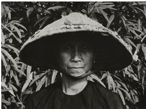
Vietnam, 1958 Estimate $3,000 - 5,000

Born in Hoboken in 1895, Dorothea Lange learned to photograph as a young woman before her departure for the west coast in 1918. Talented and ambitious, Lange opened a portrait studio that catered to San Francisco's upper crust. After witnessing first-hand the social upheaval caused by the Depression, she took to the streets with her camera, taking images of labor demonstrations, the newly unemployed, and men, women, and children who were without home or income – images that would set the trajectory for the rest of her career.