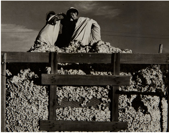
Migratory Cotton Pickers, Eloy, Arizona, 1940 Estimate: $7,000 - 9,000