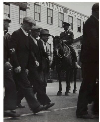
Police Officer on Horseback, 1934 Estimate: $4,000 - 6,000