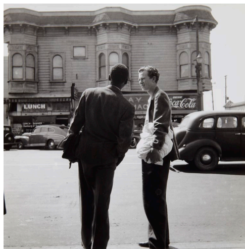
Two Men Talking on the Street (Oakland or Richmond), 1942 Estimate: $4,000 - 6,000