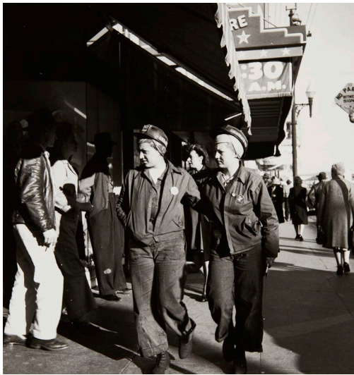
Women Workers, Richmond Shipyard, 1943 Estimate: $6,000 - 8,000