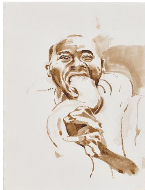
© Michael Armitage. Michael Armitage Snake Charmer , 2020 Estimate £20,000-30,000