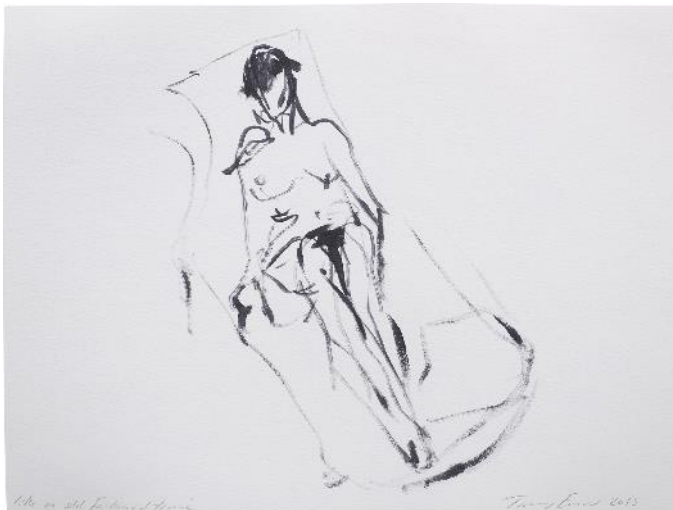
Tracey Emin Like an Old Fashioned Time , 2013 Estimate £10,000-15,000

Comic Relief has been funding arts-based projects that are tackling serious issues such as homelessness, domestic abuse and mental health for many years, helping to improve the wellbeing of individuals and communities in the UK and across the world. For more information about the work Comic Relief funds, please visit www.comicrelief.com/what-your-money-does