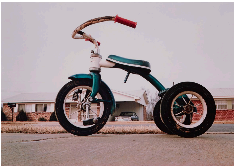
William Eggleston Memphis , circa 1969 Estimate $250,000 - 350,000 SOLD $317,500