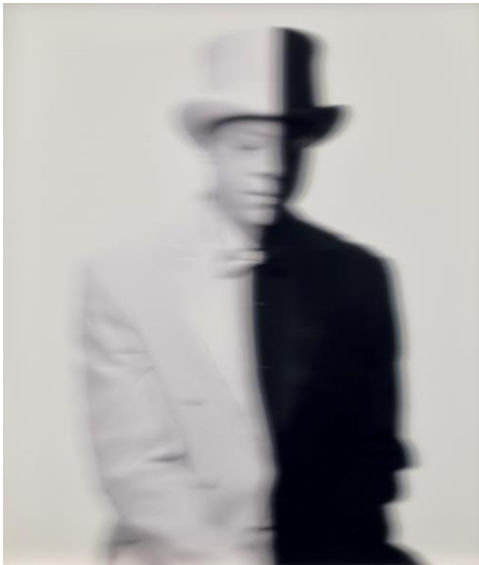
Hank Willis Thomas Seeker , 2012 Estimate: $20,000 - 30,000