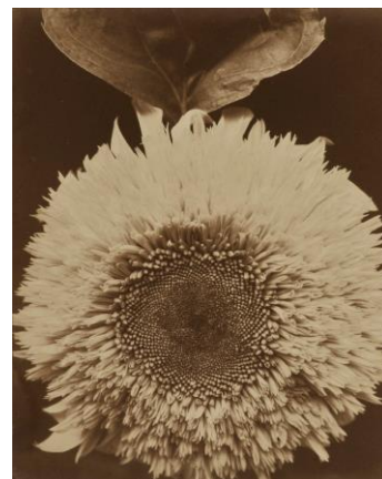
Edward Steichen Double Sunflower, 1920 Estimate: $50,000 - 70,000