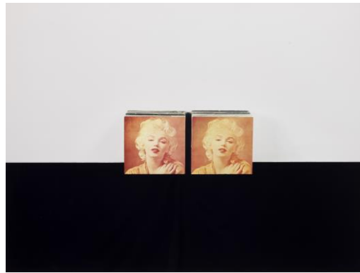
Anne Collier Double Marilyn , 2007 Estimate: $30,000 - 50,000