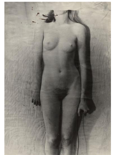
Francesca Woodman Self-Portrait (with bird) , 1976-1978 Estimate: $150,000 - 250,000

Phillips is honored to present Important Photographs from a Distinguished American Collection, a choice group carefully curated over decades and focusing on Modernist photography. Tina Modotti's elegantly composed Telegraph Wires , circa 1925, artfully captures the modernization of Mexico, her adopted country. A suite of rare large-format photogravures by Alfred Stieglitz, experimental work by Francis Bruguière, and classics by Irving Penn and Dorothy Norman round out this sequence.