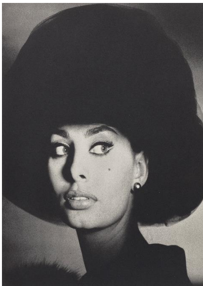
Irving Penn Sophia Loren, 1959 Estimate: $30,000 - 50,000