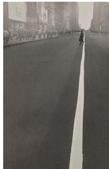
Robert Frank 34th Street, New York City, 1948 Estimate: $60,000 - 80,000