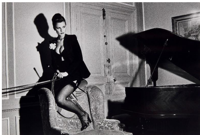
Helmut Newton Saddle II, Paris, 1976 Estimate: $40,000 - 60,000