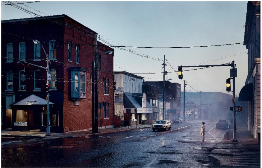
Gregory Crewdson Untitled , 2003 Estimate: $40,000 - 60,000