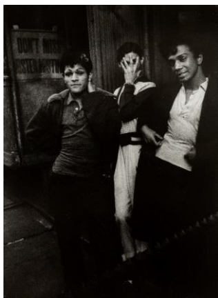
Robert Frank New York City, 1955 Estimate: $15,000 - 25,000