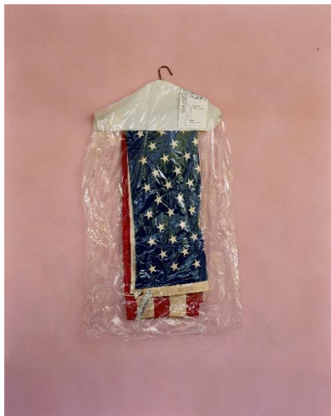
Mitch Epstein Flag, 2000 Estimate: $20,000 - 30,000