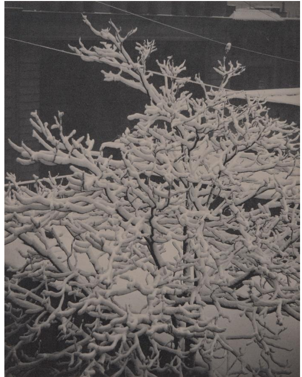
Alfred Stieglitz From the Back Window – 291 – Snow Covered Tree, Back-Yard , 1915 Estimate: $250,000 - 350,000

The auction features important early work by two of the key figures in 20th-century photography, Alfred Stieglitz and Edward Steichen. Stieglitz's From the Back Window—291—Snow Covered Tree, Back-Yard , 1915, captures the quiet perfection of a snowy evening from the back window of his gallery and showcases his technical and aesthetic genius. Steichen's virtuosic Double-Sunflower is a synthesis of aesthetics and craft, while Greta Garbo, Hollywood , 1928, and Spectacles , 1926, illustrate the glamorizing power of his vision.