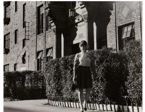
Cindy Sherman Untitled Film Still #18 , 1978 Estimate: $80,000 - 120,000

The sale presents a fine group of photographs by Peter Hujar, including his poignant portrait, David Wojnarowicz (Village Voice "Heartsick: Fear and Loving in the Gay Community") , 1983, first seen on the cover of The Village Voice in 1983 for an article about the ravages of AIDS. Peter Beard's Francis Bacon on his roof @ 80 Narrow Street, London (soon to be lost gambling) , during the dead elephant interviews for End-Game , March 1970, celebrates the artists' complex friendship within its brilliantly embellished and collaged composition. The sale boasts two iconic early Cindy Shermans: Untitled Film Still #18 , 1978, and Untitled Film Still #27b , 1979. Other offerings include three