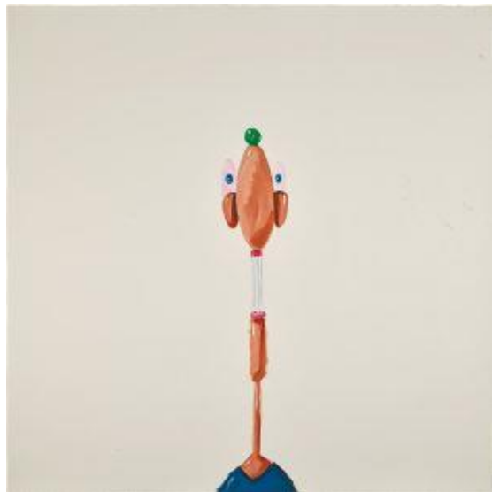
George Condo Stepmonk's Diary , 1996 Estimate: $200,000-300,000

Among the top lots of the auction is George Condo's Stepmonk's Diary , a monumental six-foot work on paper. The work exemplifies the artist's distinctive portraiture style, blending art historical references like Old Masters, Surrealism, and Cubism with pop culture. Known for his grotesque, cartoon-like figures, Condo's work challenges traditional representations of the human form, creating "antipodal beings" that blur the lines between familiar and foreign. His concept of "psychological cubism" presents multiple emotional states simultaneously in one figure. Executed in 1996, Stepmonk's Diary features a faceless, dreamlike figure emerging from the artist's imagination, encapsulating Condo's exploration of identity and psychological depth. With the work having been acquired by the present owner directly from the artist, Phillips' September auction marks the first time that Stepmonk's Diary is being offered publicly.