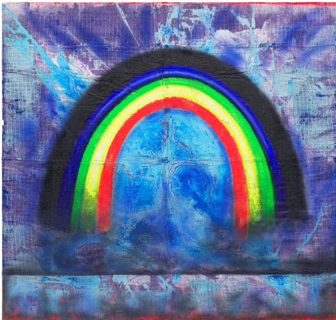
Vaughn Spann A promise of sunshine after the rain, 2021 Estimate: $120,000-180,000

Proceeds from 7 Lots to Benefit NOISE FOR NOW, Raising Awareness and Funds for Reproductive Healthcare Across the United States