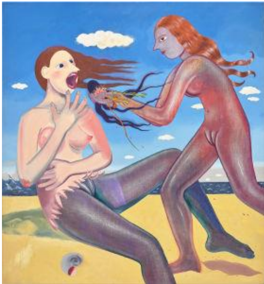
Sara Anstis Only the Beach, the Sea, and the Two of Us , 2019 Estimate: $10,000-15,000