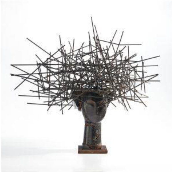
Manolo Valdés Daphne I , 2009 Estimate: $200,000-300,000