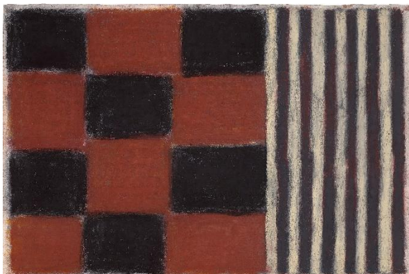
Sean Scully Untitled , 1991 Estimate: $200,000-300,000

Sean Scully's Untitled , 1991, marks a pivotal moment in the artist's career, merging the stripes of his 1980s works with the checkerboard patterns that defined his early 1990s paintings. United by the soft blending of pastel colors, the composition juxtaposes vertical stripes with a red and black grid, creating a dynamic visual rhythm. Scully saw the checkerboard as a breakthrough, forcing him to paint "without direction," unlike the structured nature of stripes. The work's geometric forms are softened by gestural brushwork, capturing the tension between order and chaos. Influenced by Mexican architecture and Irish stone walls, Scully's use of "bricks" evokes the passage of time, while his tonal palette reflects deeper emotional truths.