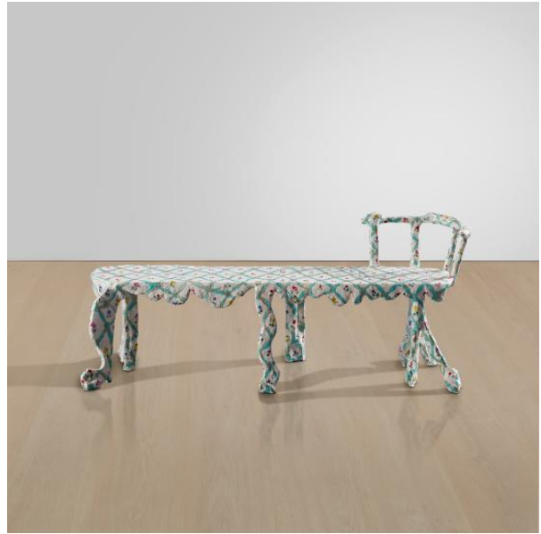
Francesca DiMattio Sevres Mint Bench , 2022 Estimate: $8,000-12,000