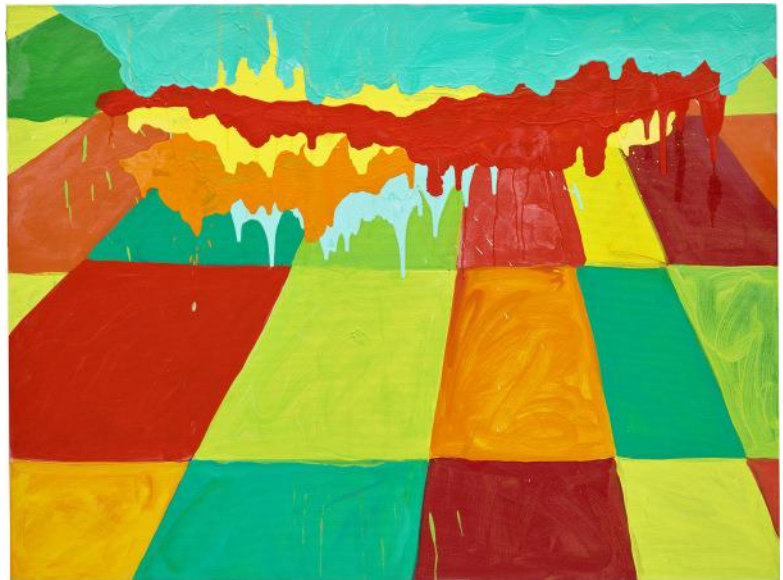
Mary Heilmann Go Ask Alice , 2006 Estimate: $70,000-100,000