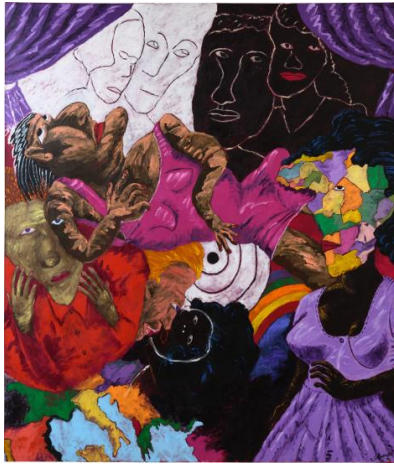
Robert Colescott A Death of an Old Mulatta , 1991 Estimate: $500,000-700,000