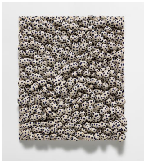
Yayoi Kusama Red Stripes , 1965 Estimate: $2,500,000 – 3,500,000

As previously announced , two significant early works by Yayoi Kusama from the collection of Agnes and Frits Becht will be offered in the sale, marking the first time they will be sold in nearly sixty years, following the original acquisition by the Bechts in 1965. The internationally-renowned pair of soft-sculpture works, Blue Spots and Red Stripes , are some of the earliest known examples of Kusama's famous tuberous forms, iconic motifs that now define Kusama's career. The works have been exhibited extensively around the world since their creation. As the record holder for Kusama's work at auction, Phillips is proud to include these important works in the upcoming Evening Sale.