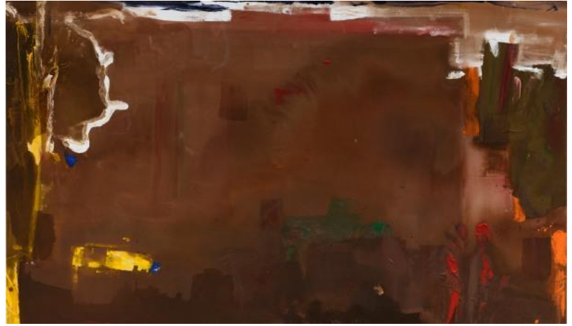
Helen Frankenthaler On the Road , 1980 Estimate: $1,500,000-2,000,000