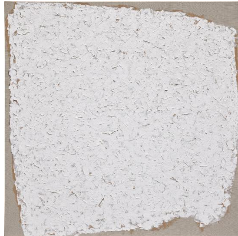
Robert Ryman Mark , 2002 Estimate: $3,000,000-4,000,000