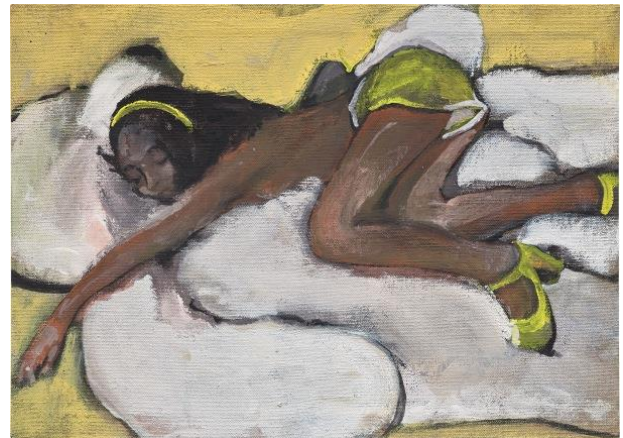
Noah Davis Untitled , 2010 Estimate: $100,000-150,000