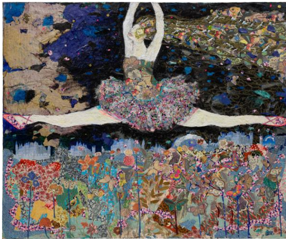
María Berrío No One Can Hear You, Only the Wind , 2012 Estimate: $1,000,000-1,500,000