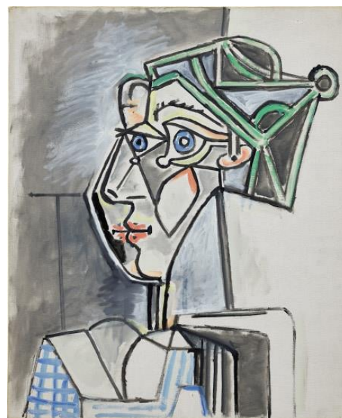
Pablo Picasso Tête de femme au chignon , 1952 Estimate: $6,000,000 – 9,000,000

Also among the Evening Sale highlights is Pablo Picasso's Tête de femme au chignon , which is being offered at auction for the very first time and has never been exhibited publicly. One of the great portraitists of the 20th century, Picasso painted the work in 1952, the final year of his pivotal relationship with the artist Françoise Gilot. Facing to the left, the figure here sits with her hair pulled back in the titular chignon and gazes out a grey window marked by black bars. Growing out of a decade's worth of work inspired by Gilot, Tête de femme au chignon navigates two of Picasso's greatest post-war influences, Henri Matisse and the wider history of portraiture in Western art. With her sculpted, immutable expression, the figure in Tête de femme au chignon reaches beyond any specific model to reveal an artist disassembling the inherited norms of representation into an inventive and colorful portrait.