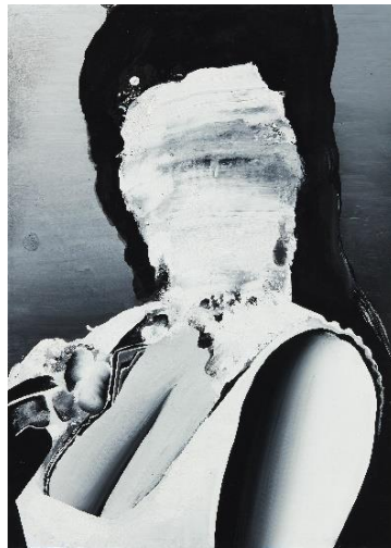
Tomoo Gokita b. 1969 So Tell Me Darlin' , 2011 Estimate: £25,000-35,000