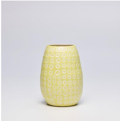
Shio Kusaka b. 1972 (carved 54) , 2014 Estimate £5,000 - 7,000