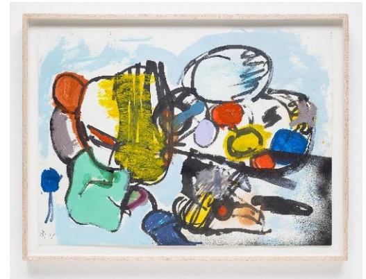
Eddie Martinez b. 1977 Untitled , 2012 Estimate £30,000 - 50,000

Auction: 12 December 2019 Auction viewing: 5-12 December Location: 30 Berkeley Square, London Click here for more information