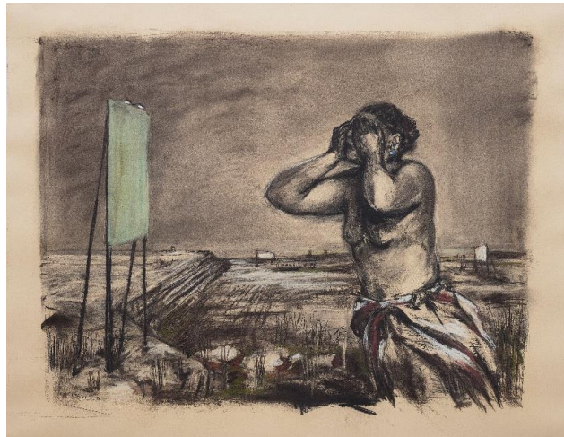
William Kentridge b. 1955 Nandi , 1993 Estimate £150,000 - 200,000