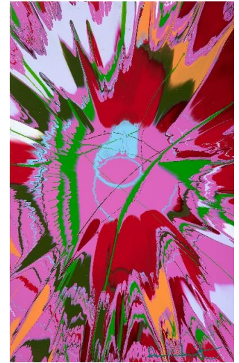
Damien Hirst b. 1965 Beautiful If At First You Don't Succeed Then Try, Try Again, One More Time, It's Done Spinning, Painting , 2008 Estimate £40,000 - 60,000

An additional highlight is Damien Hirst’s 2008 painting, Beautiful If At First You Don't Succeed Then Try, Try Again, One More Time, It's Done Spinning, Painting , which will be sold to benefit the Serpentine Gallery. Forming part of Hirst’s series of spin paintings, which he began experimenting with in 1992, the present work bears a characteristically elongated title, which, like all other works from the series, begins with ‘Beautiful’ and ends with ‘Painting’. In 1988 Hirst orchestrated an exhibition entitled Freeze in an abandoned warehouse in London. Freeze was the inaugural event of the artistic phenomenon which swiftly became known as Young British Art. This colour-splashed is an enthralling example of both Hirst’s dynamic use of colour and motion in the spin series, and his subsequent reputation as a YBA pioneer.