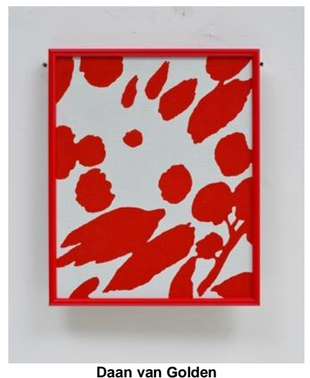
Heerenlux, 1996 Estimate: £20,000-30,000