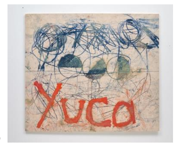
Oscar Murillo Untitled (Yuca), 2011 Estimate: £70,000-90,000

A further highlight of the sale is Oscar Murillo's Untitled (Yuca) . Executed in 2011, this work is a classic interpretation of urgency, chaos and movement undeniably linked to the artist's biographical experiences of displacement and community. Murillo explores themes of movement and change in location as well as physical activity, as shown in the present work. The artist's work has been exhibited at major galleries and fairs around the world including Art Basel, the Rubell Family Collection, The Museum of Modern Art, New York, and Serpentine Gallery, London.