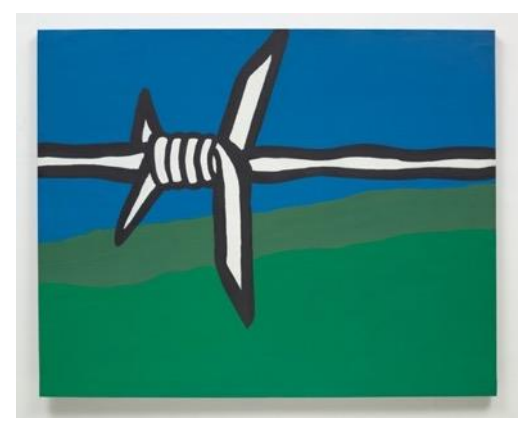
Raoul de Keyser Gampelaere omgeving, 1967 Estimate: £30,000-50,000