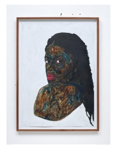
Amoako Boafo Joy , 2019 Estimate: £15,000-20,000

Following the success of Amoako Boafo's Lemon Bathing Suit , which achieved a world auction record in the London 20th Century & Contemporary Evening Sale in February, Phillips is delighted to present two works by the artist in the New Now sale. Joy and Untitled , both painted in 2019, are exceptional examples of Boafo's work. An additional highlight in the selection of work by young and emerging popular artists is Nina Chanel Abney's Untitled (Black Love) . Painted in 2016, the present lot is engaging, colourful and characteristic of the artist's pop-surrealist style.