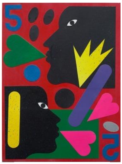
Nina Chanel Abney Untitled (Black Love), 2016 Estimate: £20,000-30,000