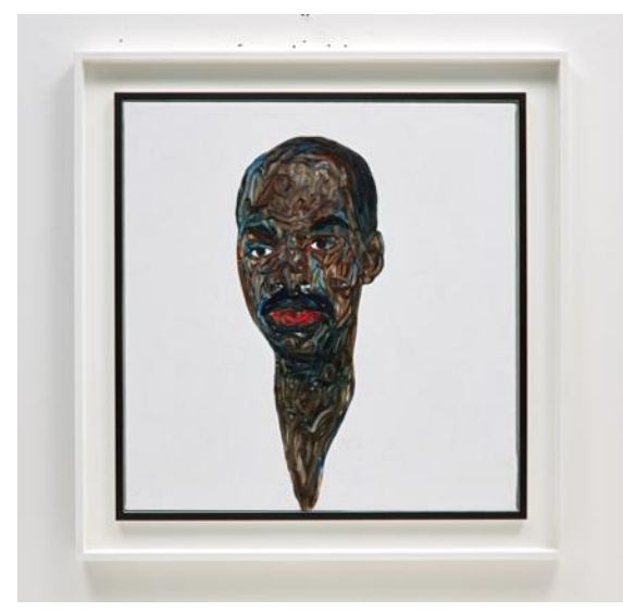
Amoako Boafo Untitled, 2019 Estimate: £20,000-30,000